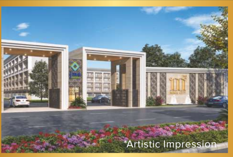
HARERA No. 64 of 2023 RC/REP/HARERA/GGM/720/452/2023/64 Dated 23/05/2023