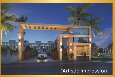
HARERA No. 118 of 2022 RC/REP/HARERA/GGM/643/375/2022/118 Dated 13/12/2022