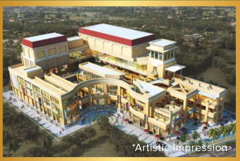
HARERA No. 22 of 2018 HARERA-2018/1397/297 Dated 02/02/2018