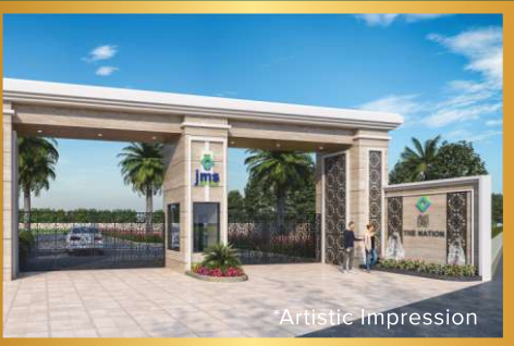
HARERA No. 89 of 2023 RC/REP/HARERA/GGM/745/477/2023/89 Dated 11/09/2023