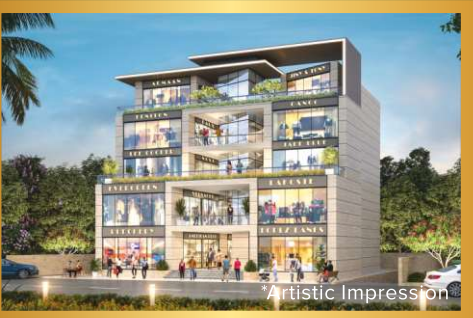
HARERA No 118 of 2024 RC/REP/HARERA/GGM/891/623/2024/118 Dated 09/12/2024