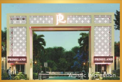
HARERA No. 03 of 2021 RC/REP/HARERA/GGM/435/167/2021/03 Dated 18/01/2021