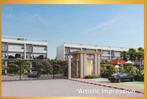
HARERA No. 06 of 2024 RC/REP/HARERA/GGM/779/511/2024/06 Dated 30/01/2024