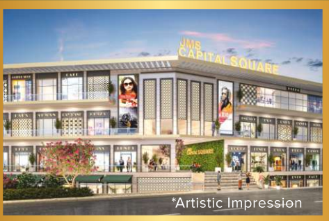
HARERA No. 82 of 2024 RC/REP/HARERA/GGM/855/587/2024/82 Dated 02/08/2024