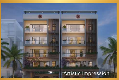
HARERA No. 28 of 2024 RC/REP/HARERA/GGM/801/533/2024/28 Dated 18/03/2024