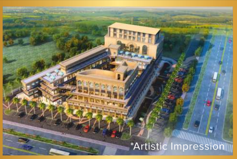
HARERA No. 07 of 2019 RC/REP/HARERA/GGM/313/45/2019 Dated 18/02/2019