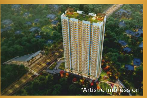
HARERA No. 39 of 2025 RC/REP/HARERA/GGM/936/668/2025/39 dated 16/04/2025