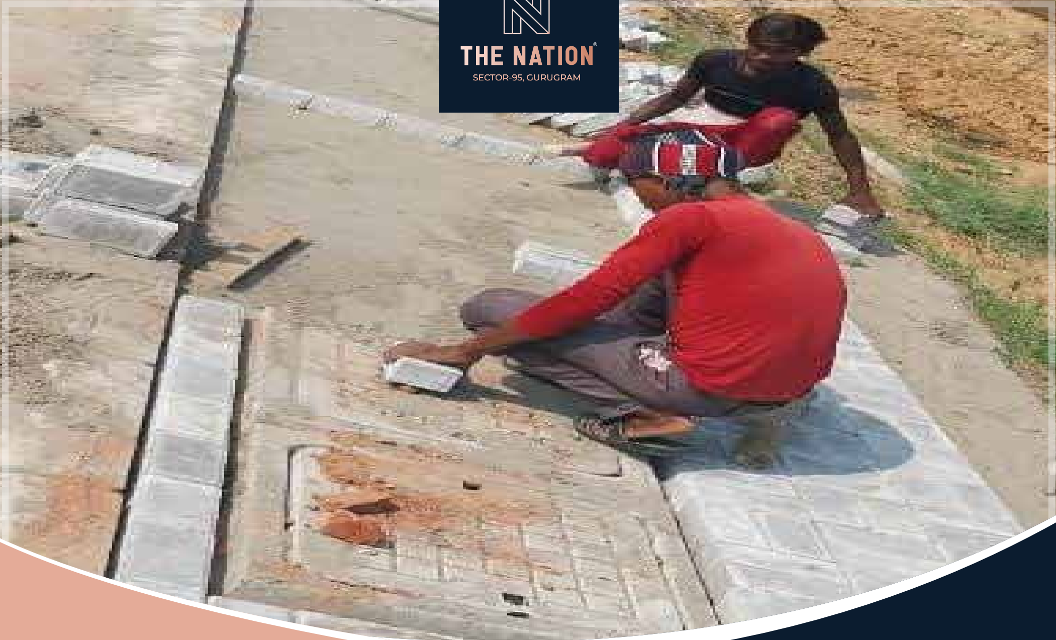
Road Pathway Paver Fixing Work In Progress