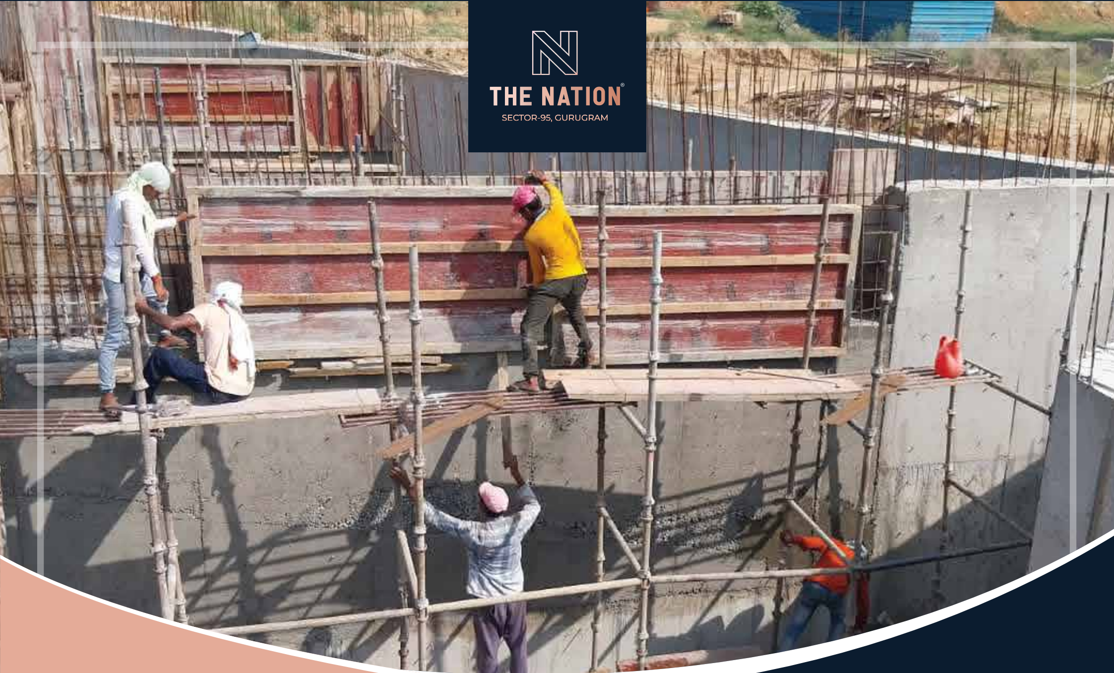
UG Water Tank Structure Work In Progress