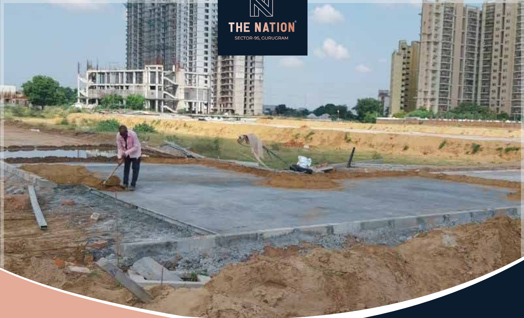
Road Trimix Work In Progress