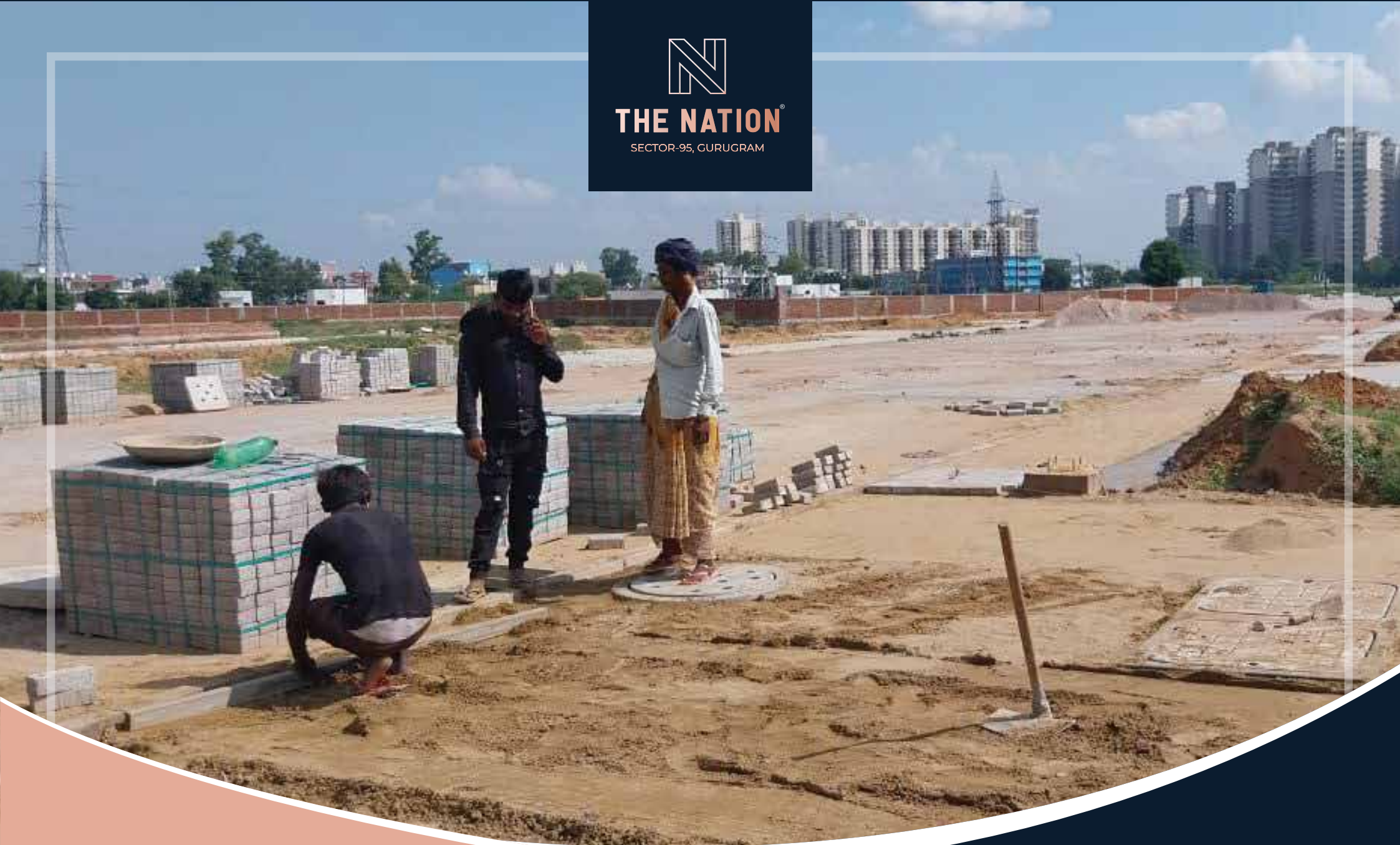
Road Pathway Paver Fixing Work In Progress