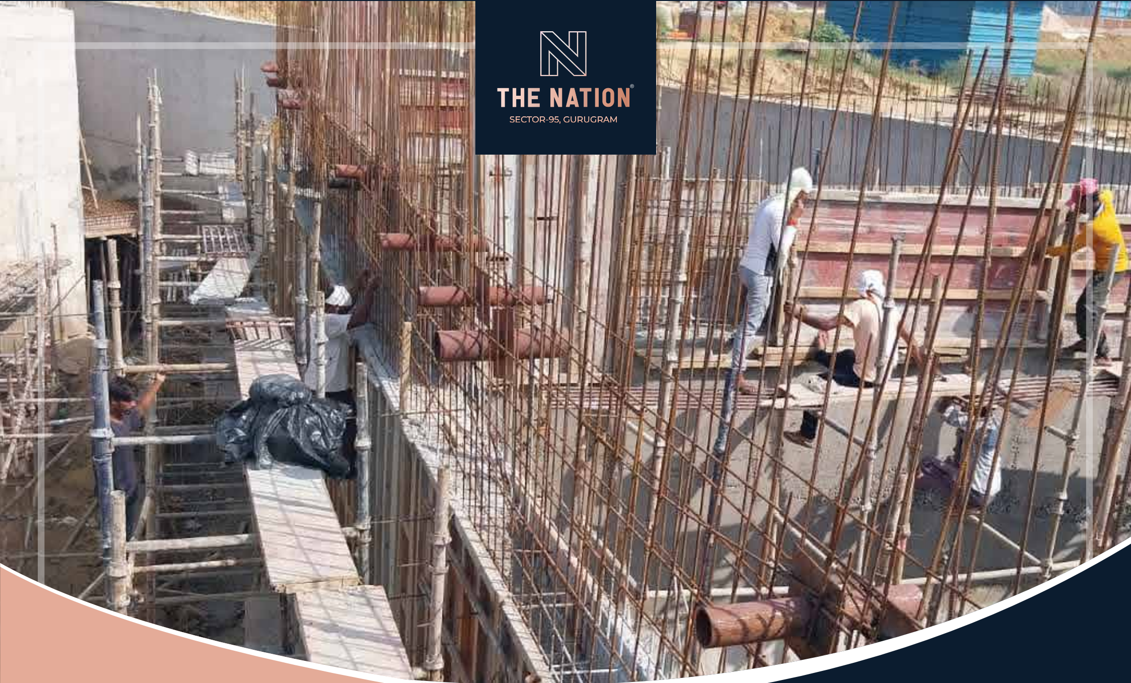
UG Water Tank Structure Work In Progress