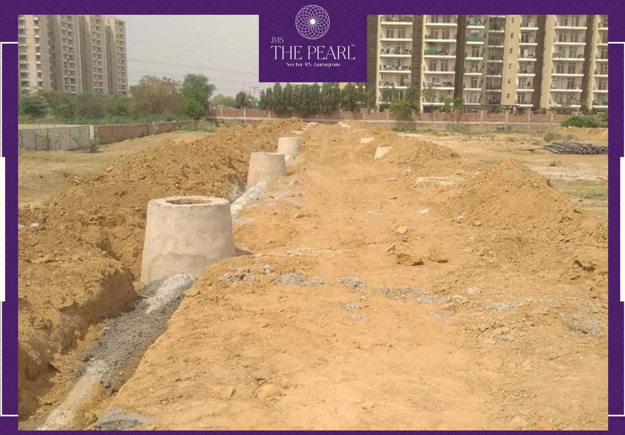
Storm Line Laying Work In Progress