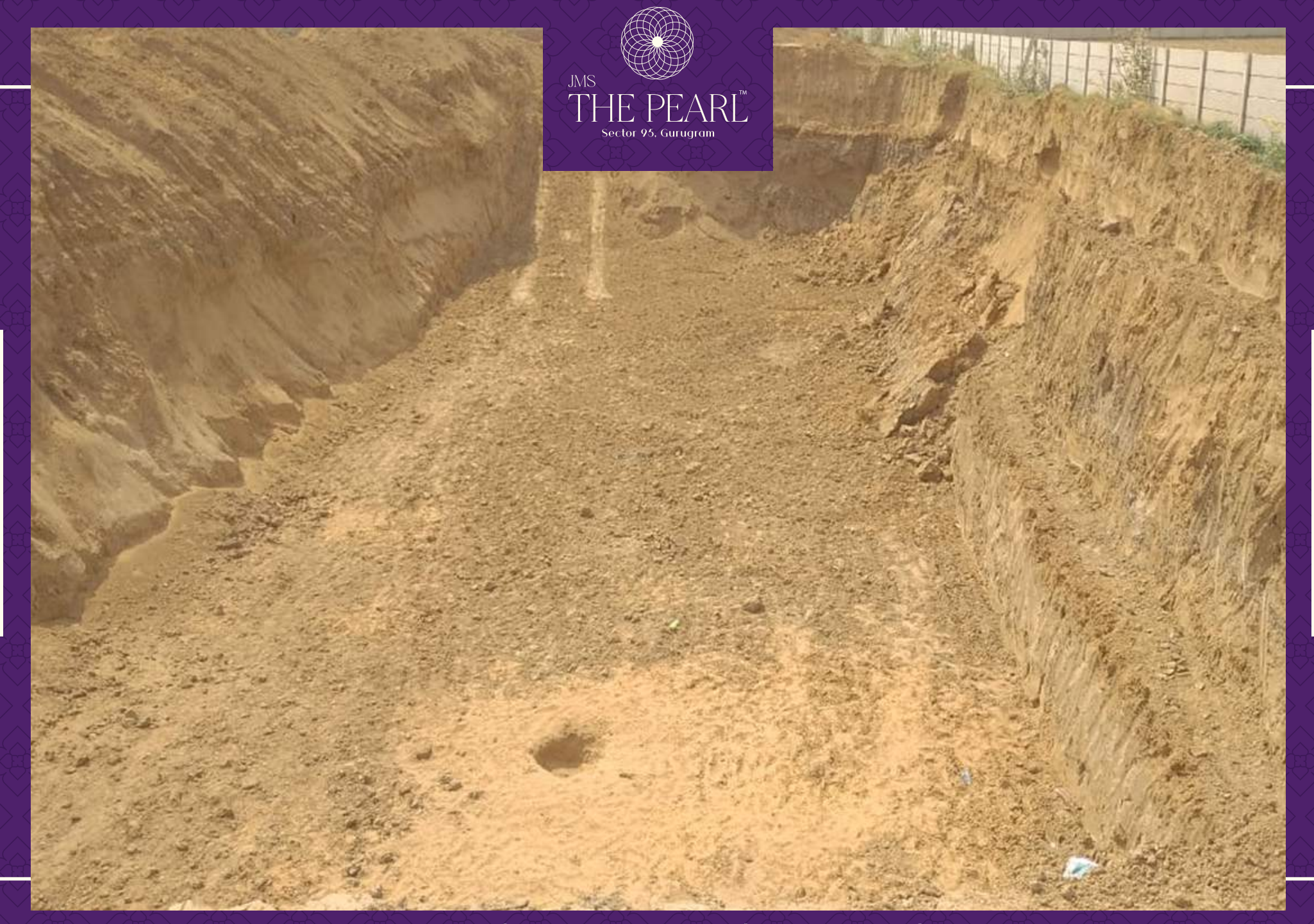
STP Tank Excavation Work Completed