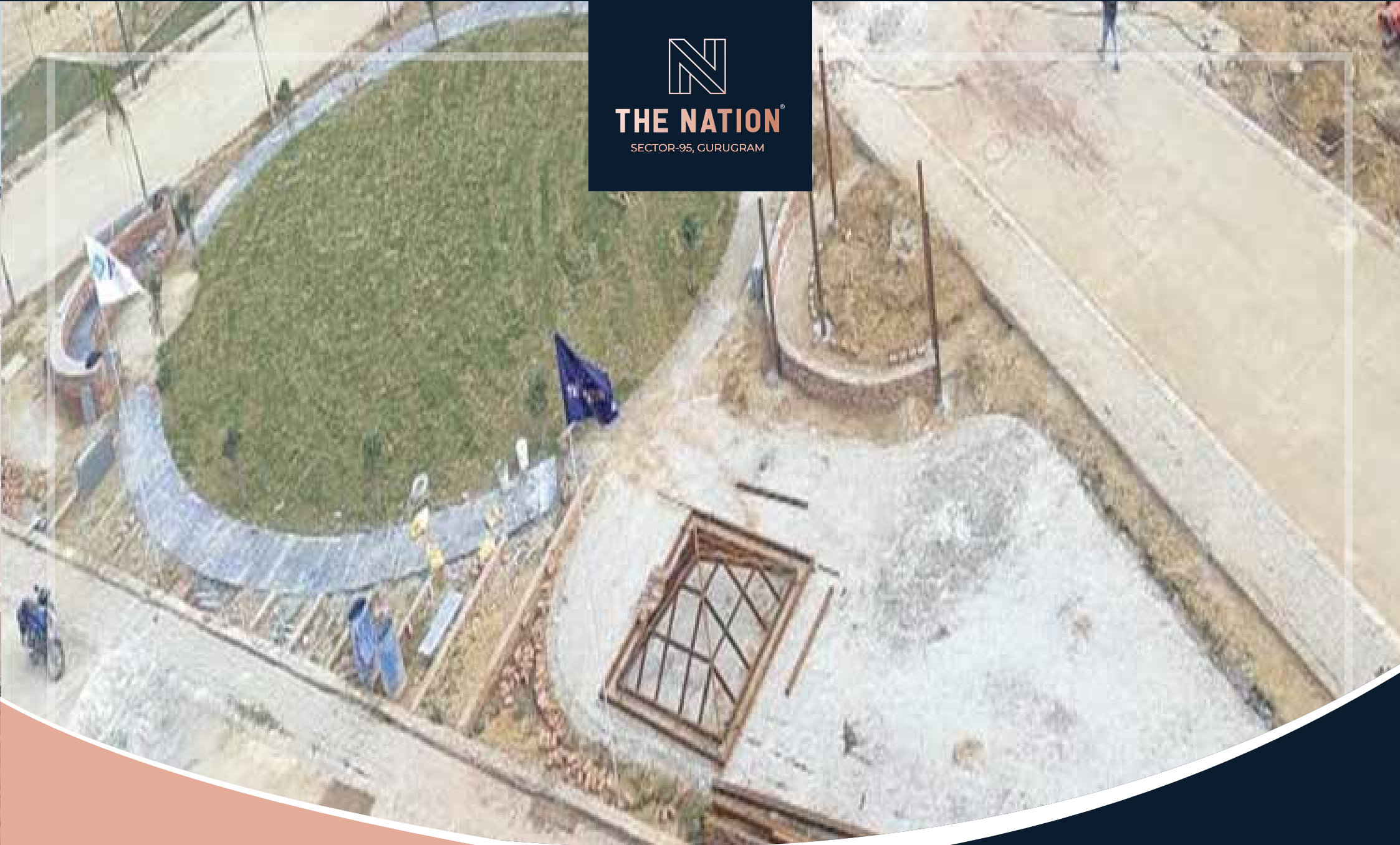
Park (G-9) Development Work In Progress