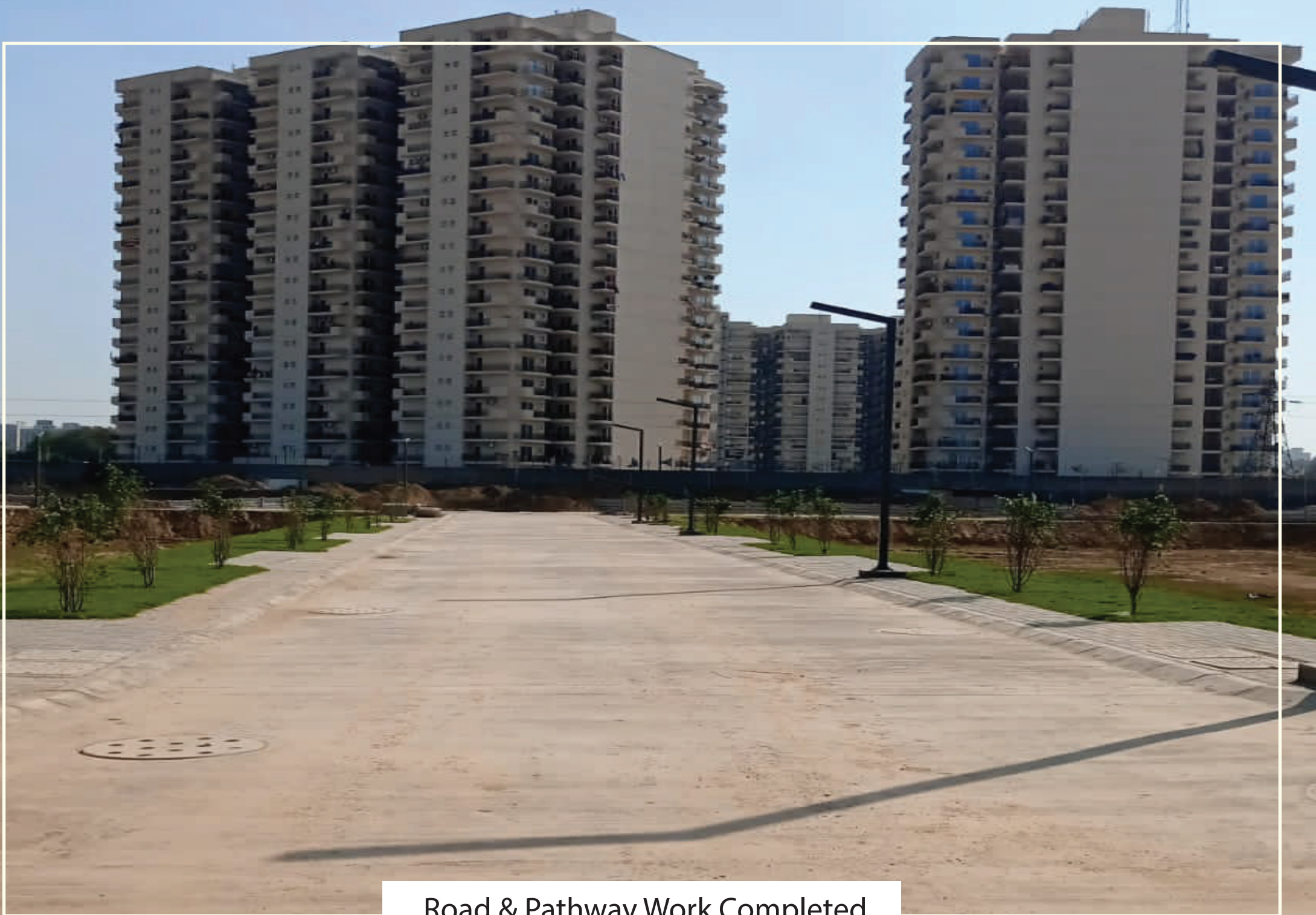
Road & Pathway Work Completed