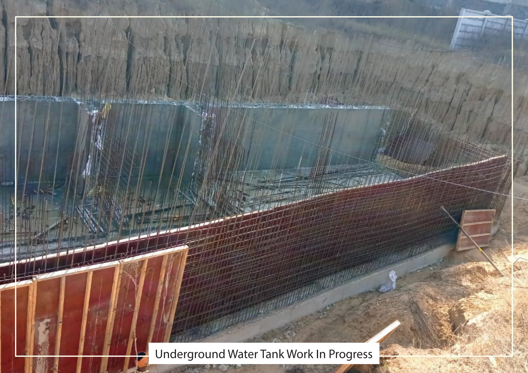
Underground Water Tank Work In Progress