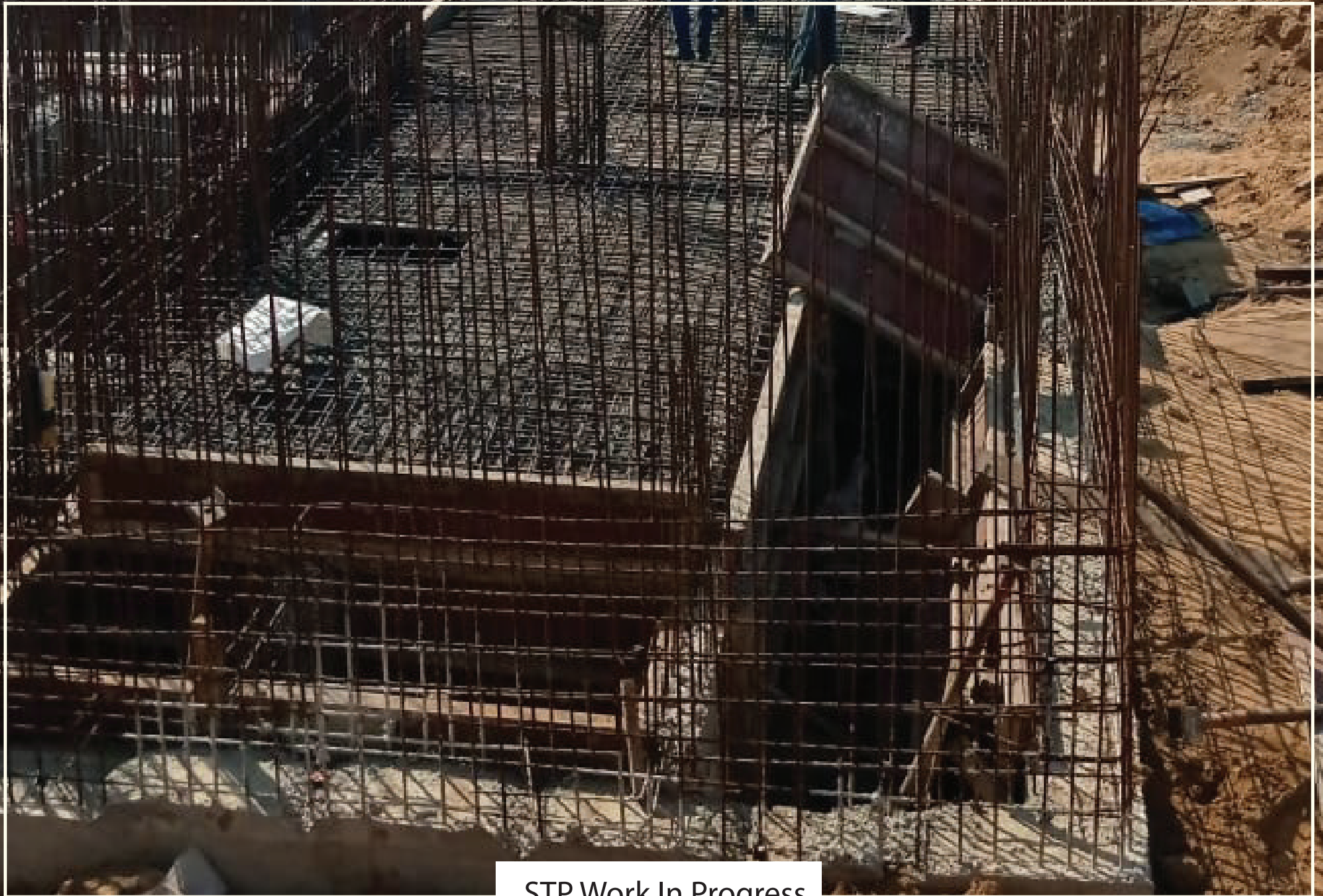
STP Work In Progress