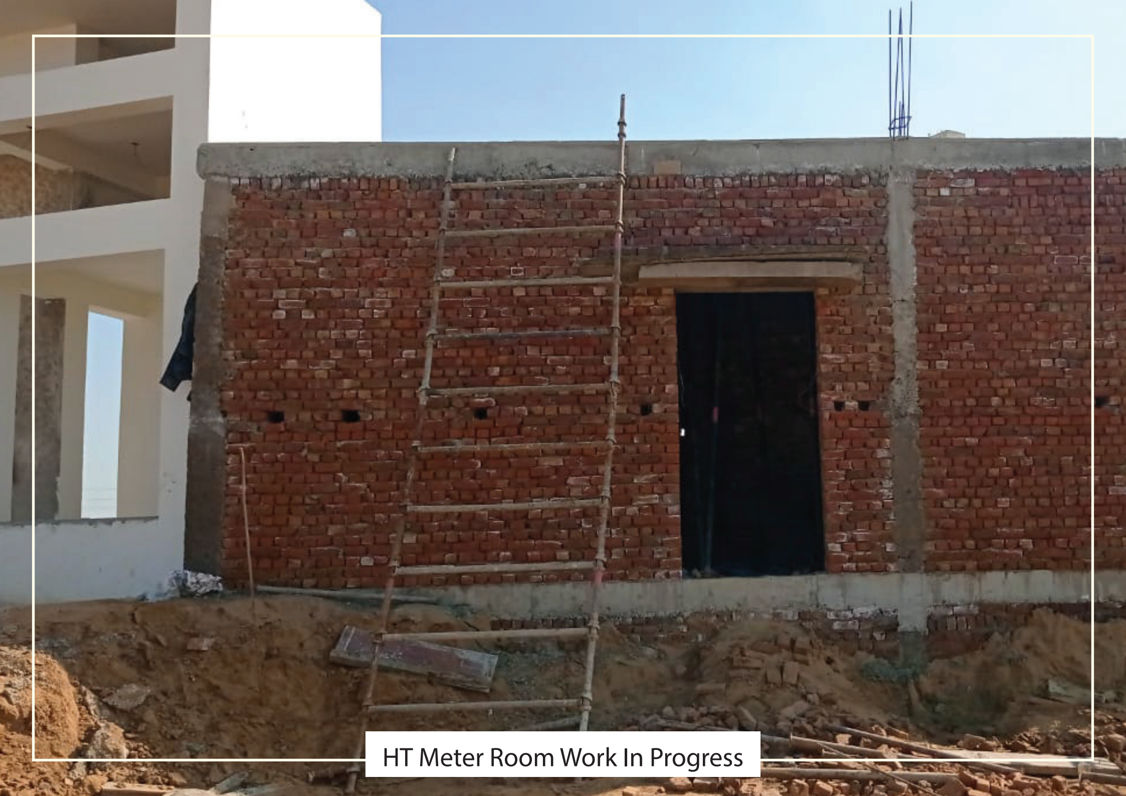
HT Meter Room Work In Progress