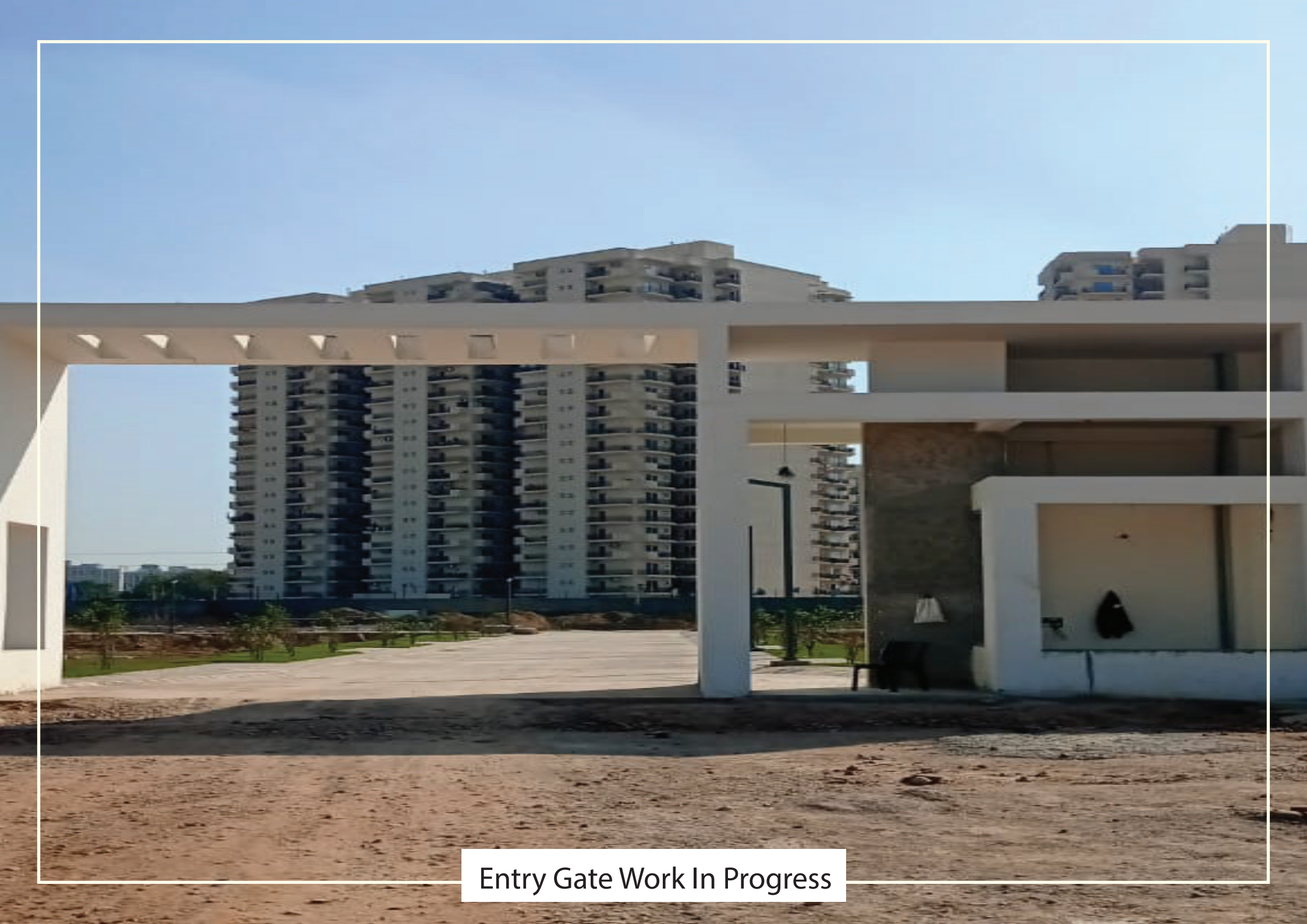
Entry Gate Work In Progress