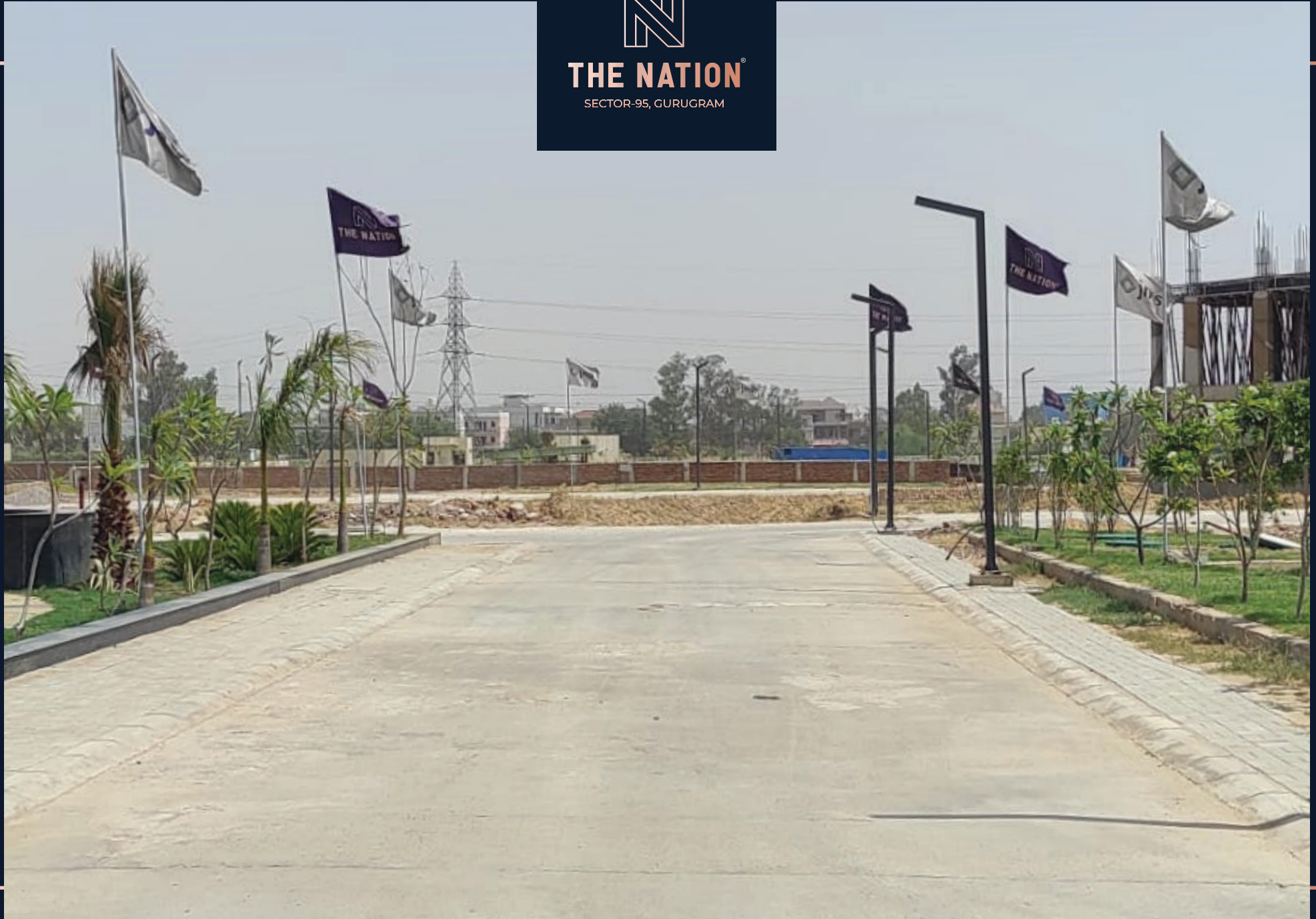
Pathway Development Work In Progress