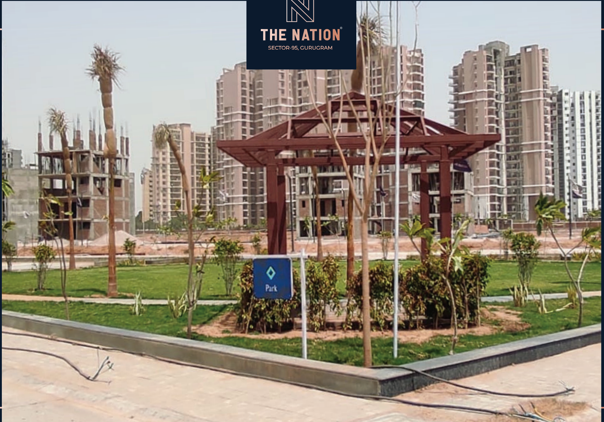
Park G-9 Development Work In Progress