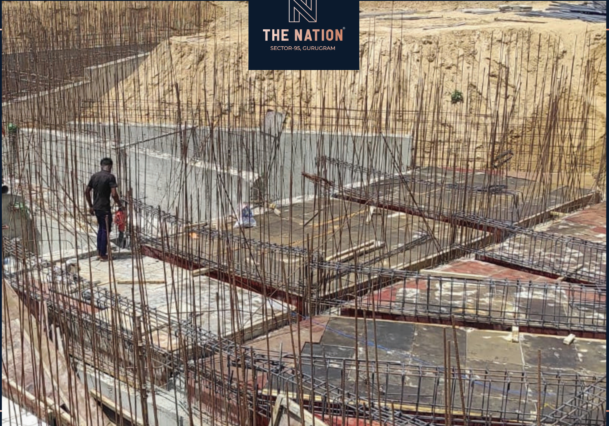
STP Construction Work In Progress