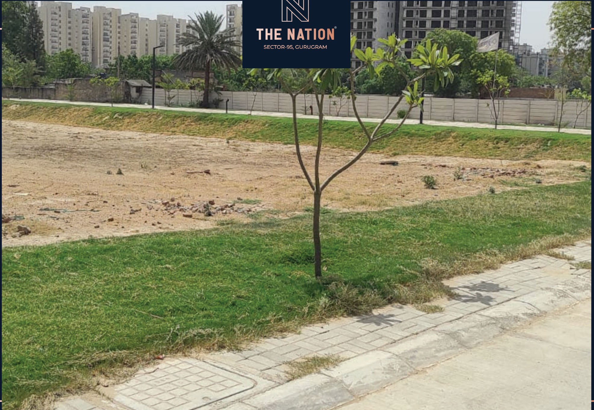
Pathway Development Work In Progress