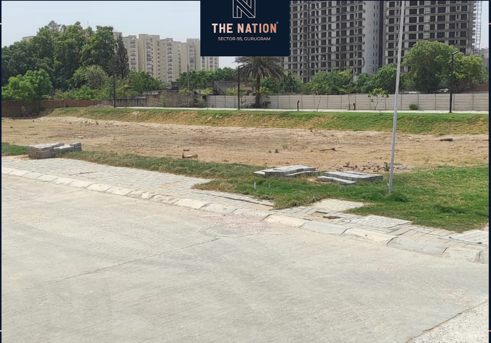
Pathway Development Work In Progress