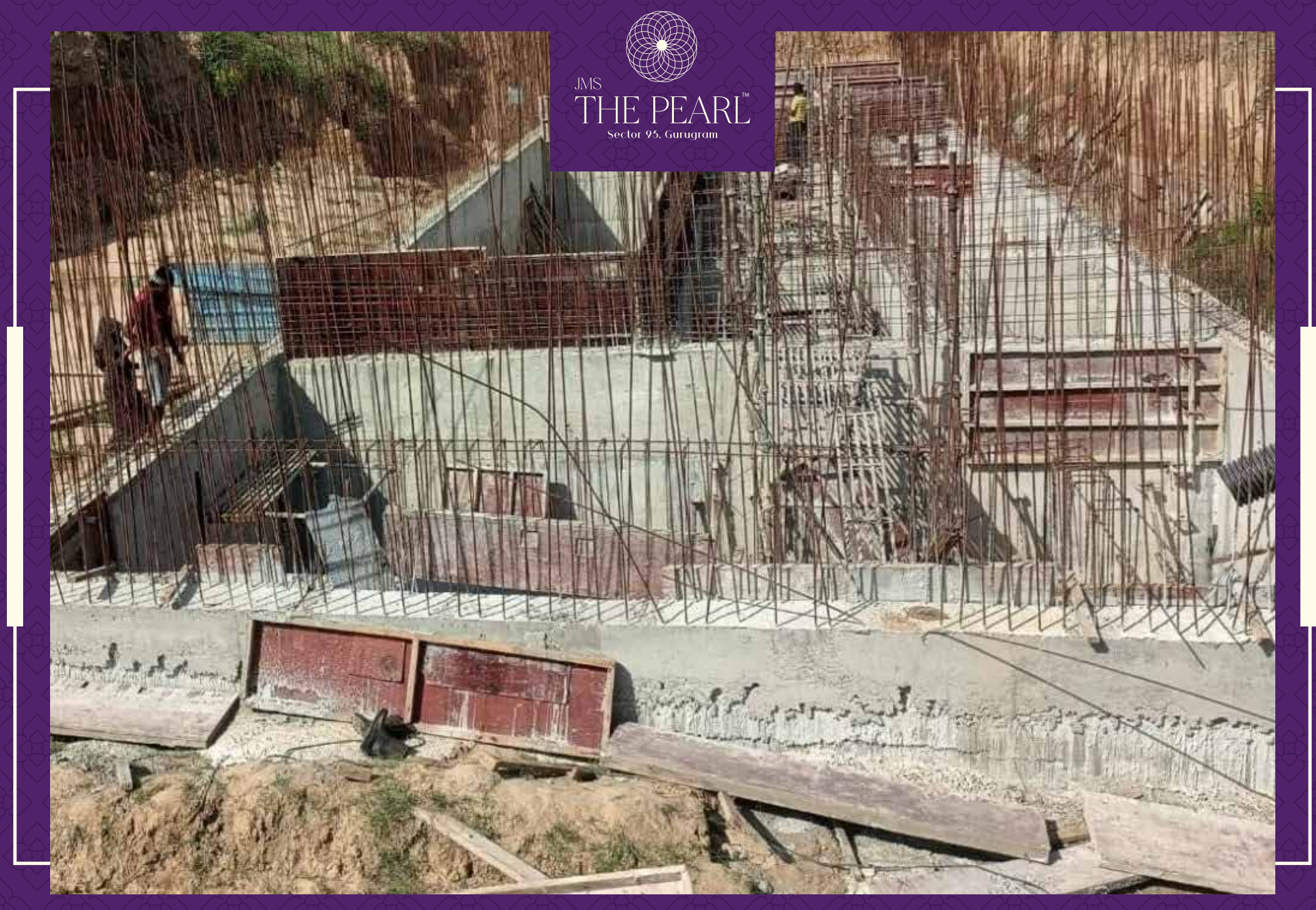
STP Construction work in progress