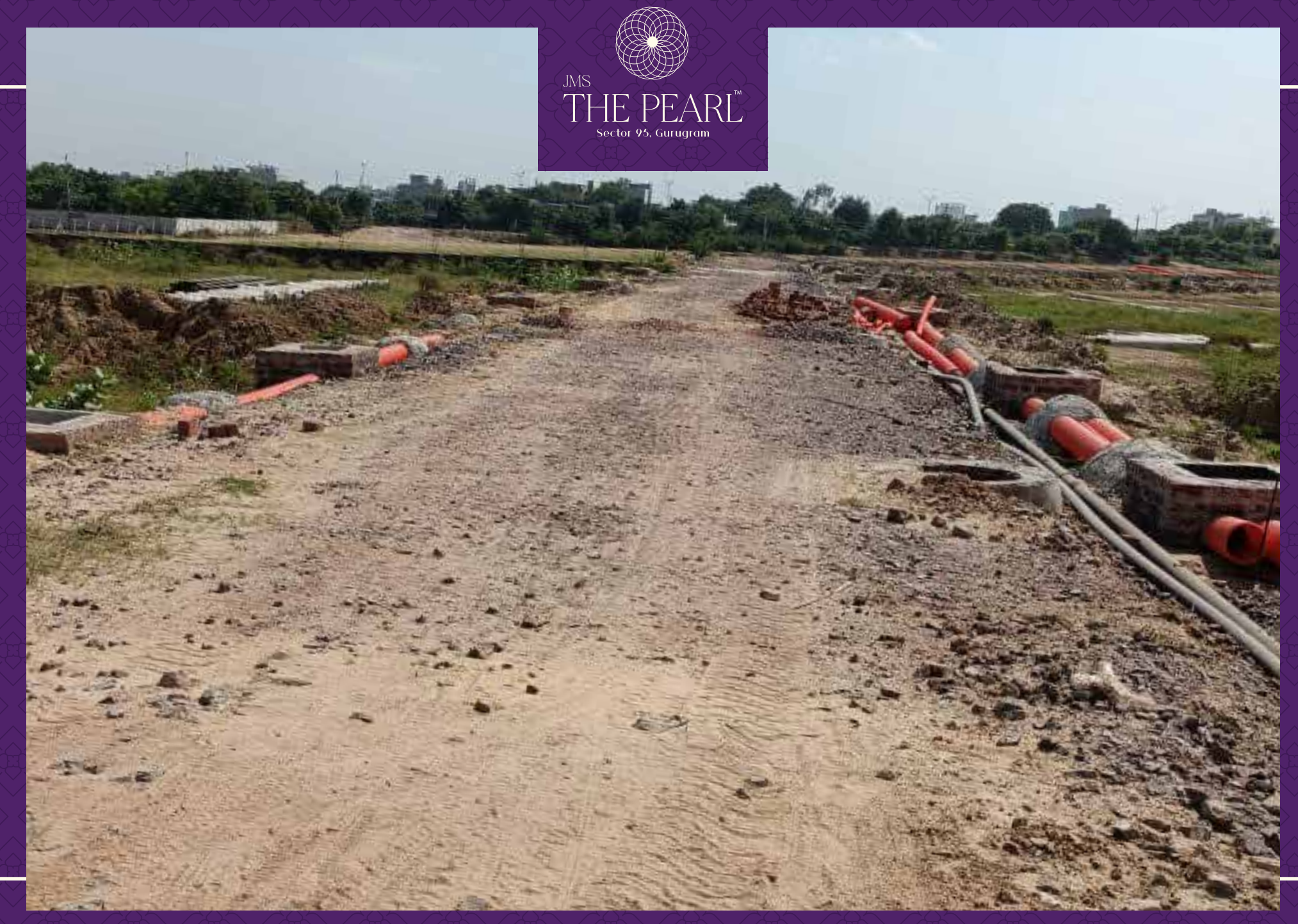
Club House Foundation Excavation in progress