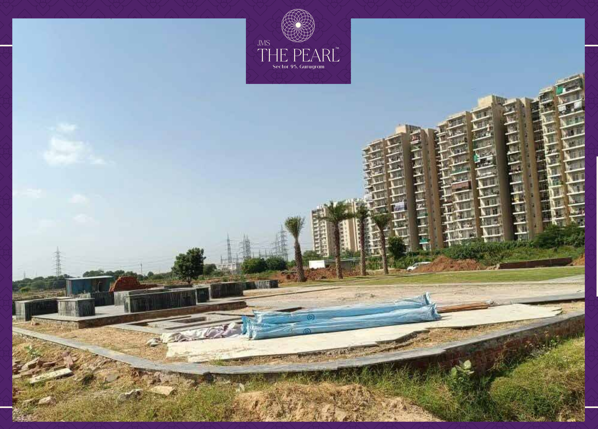
Park area development work in progress