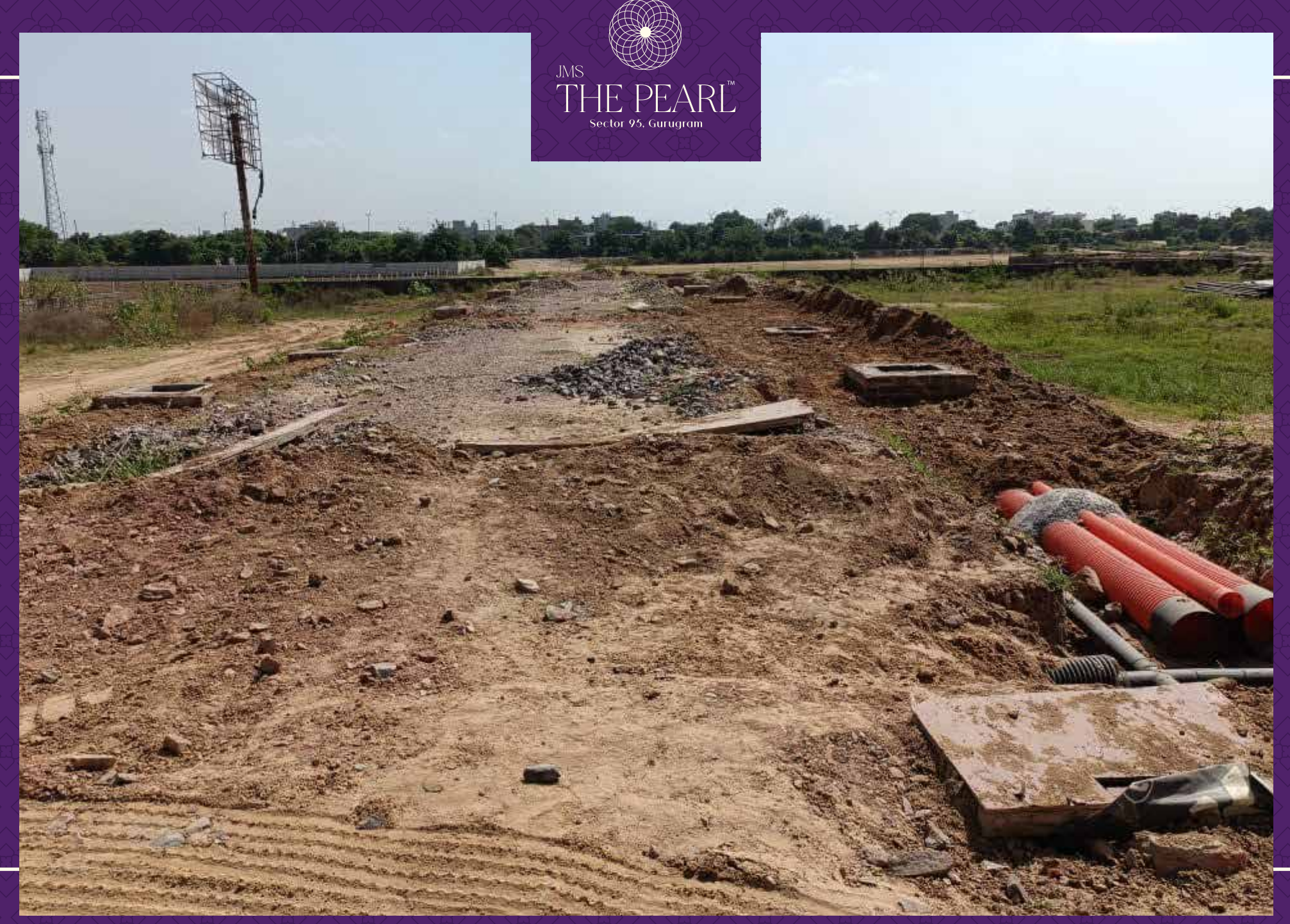
Electrical Line laying work in progress