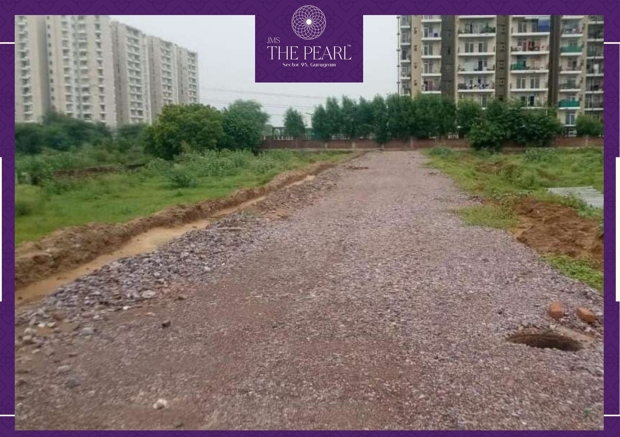
Road Work In Progress