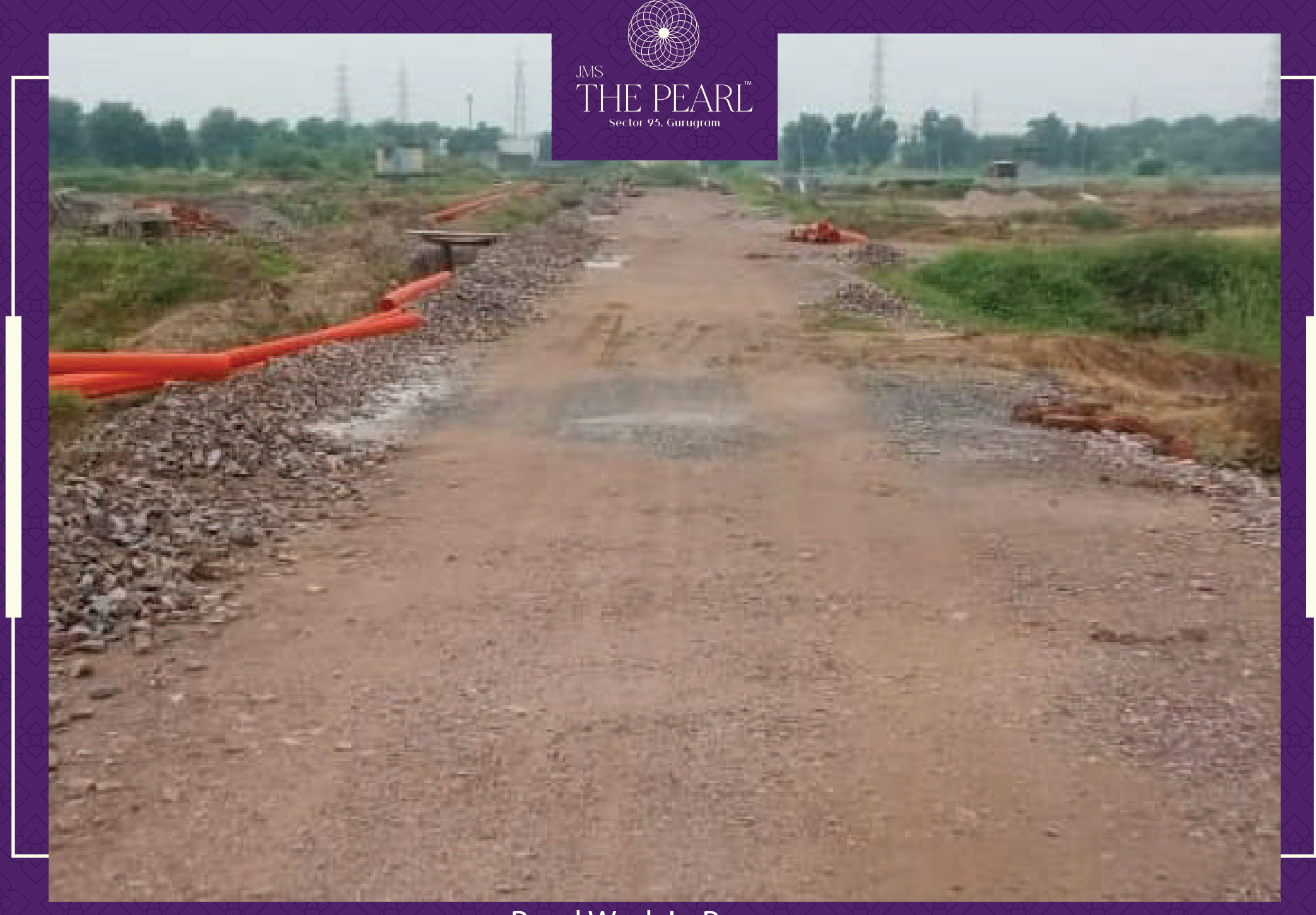
Road Work In Progress