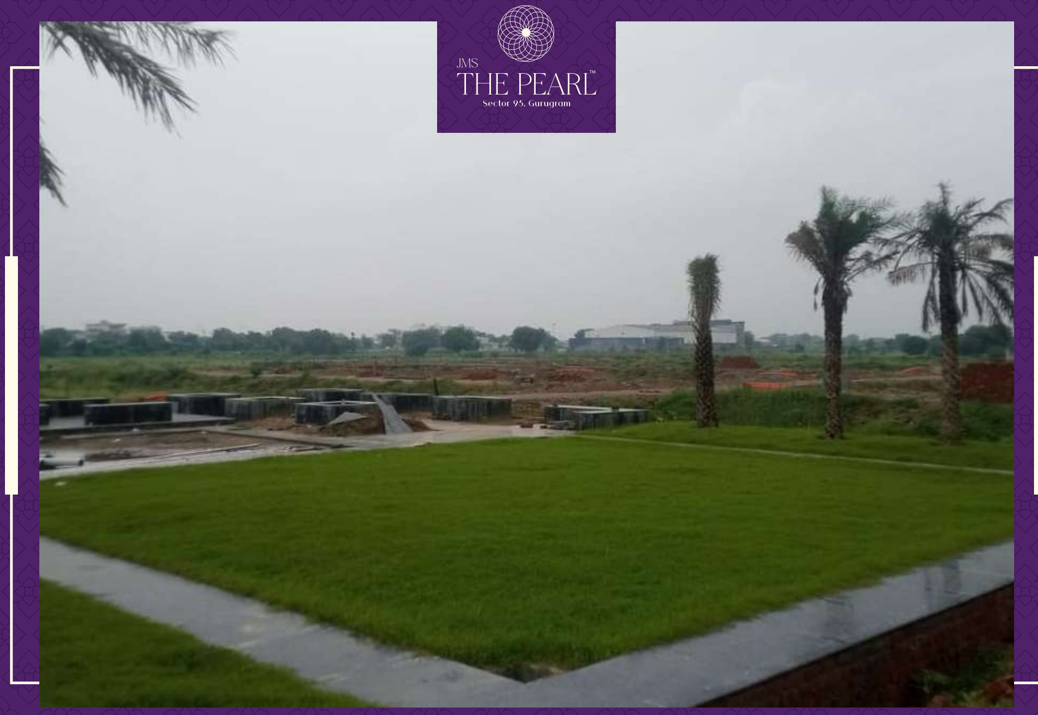
Park Area Work In Progress