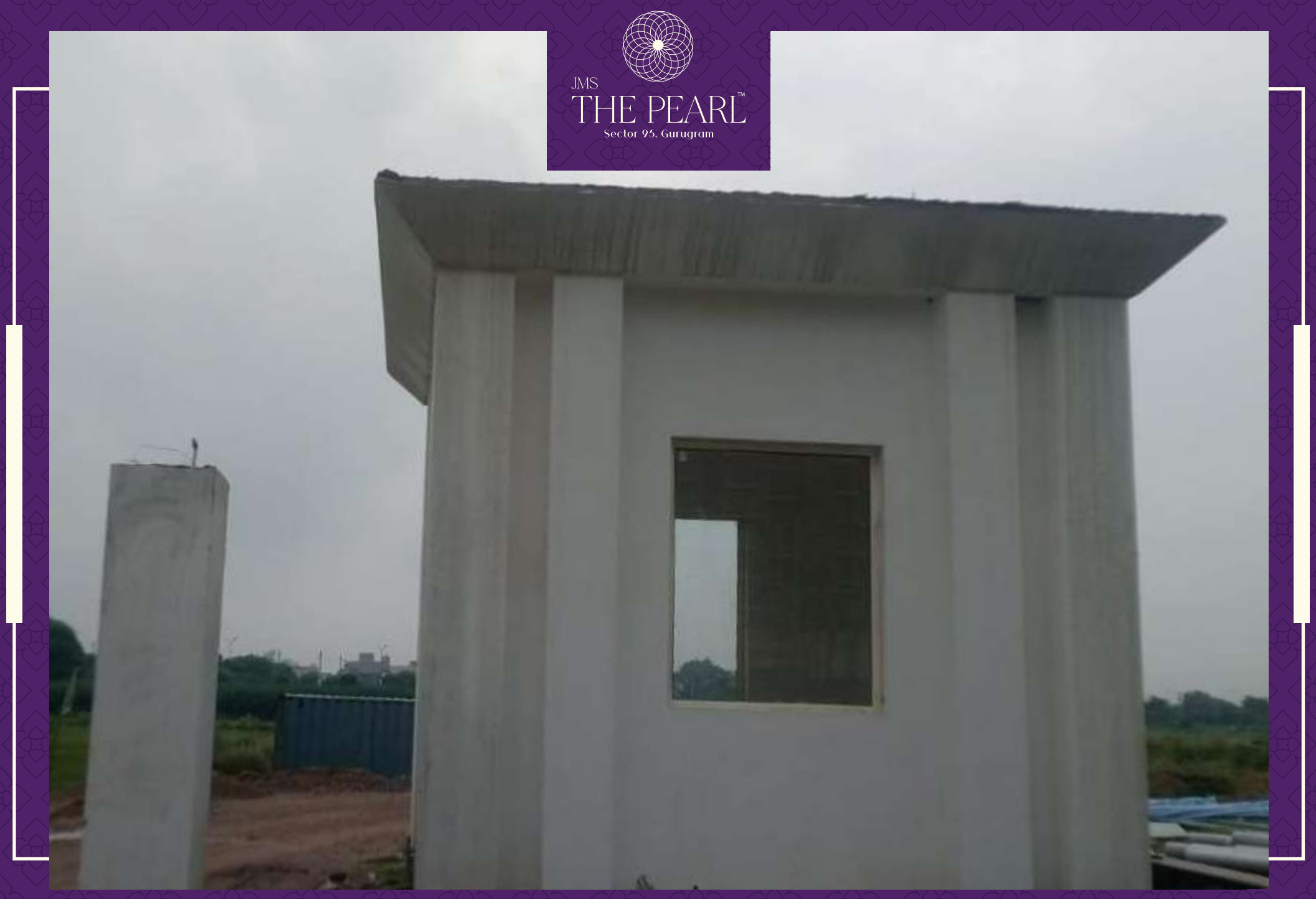
Entry Gate Work In Progress