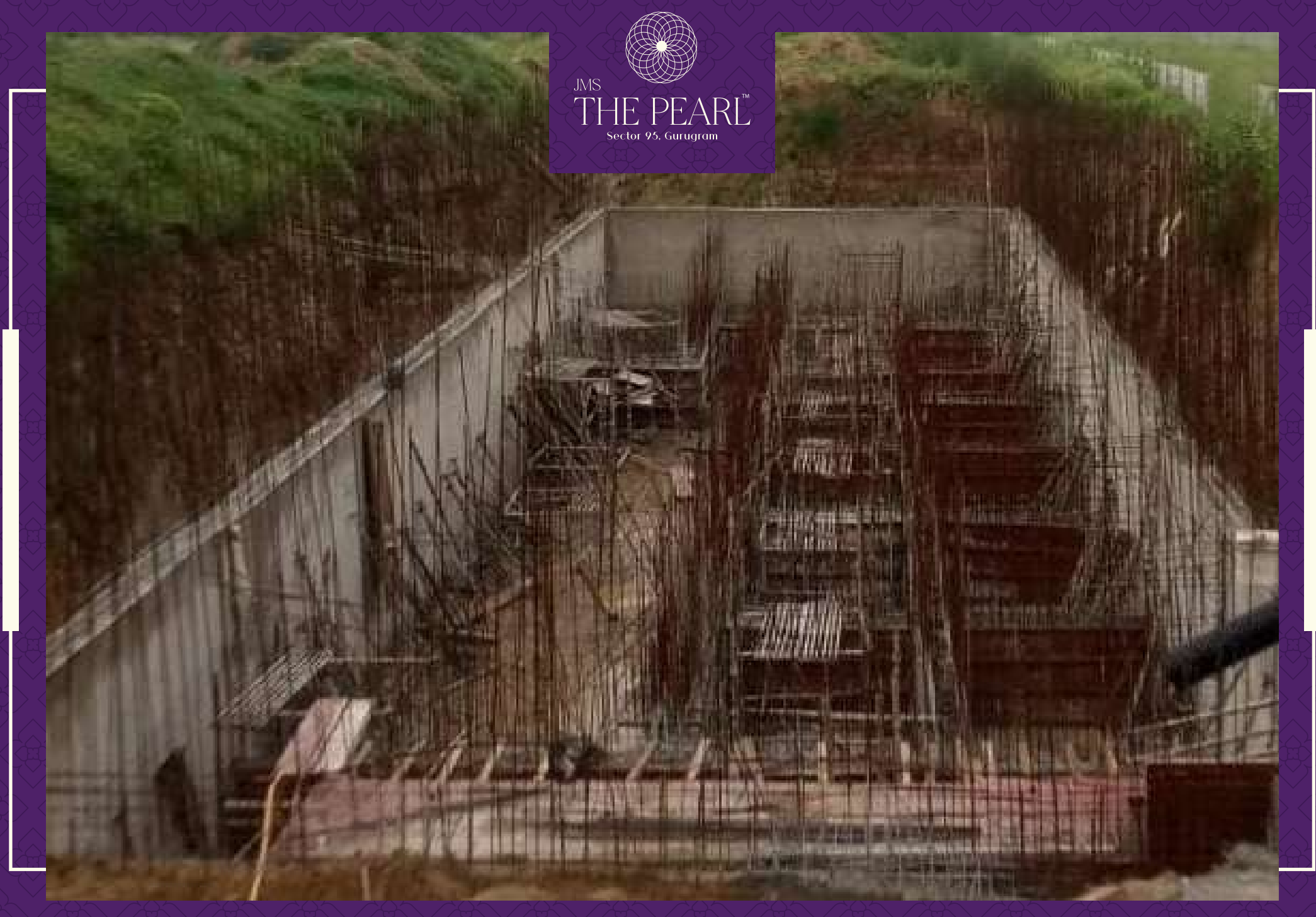
STP Structure Work In Progress