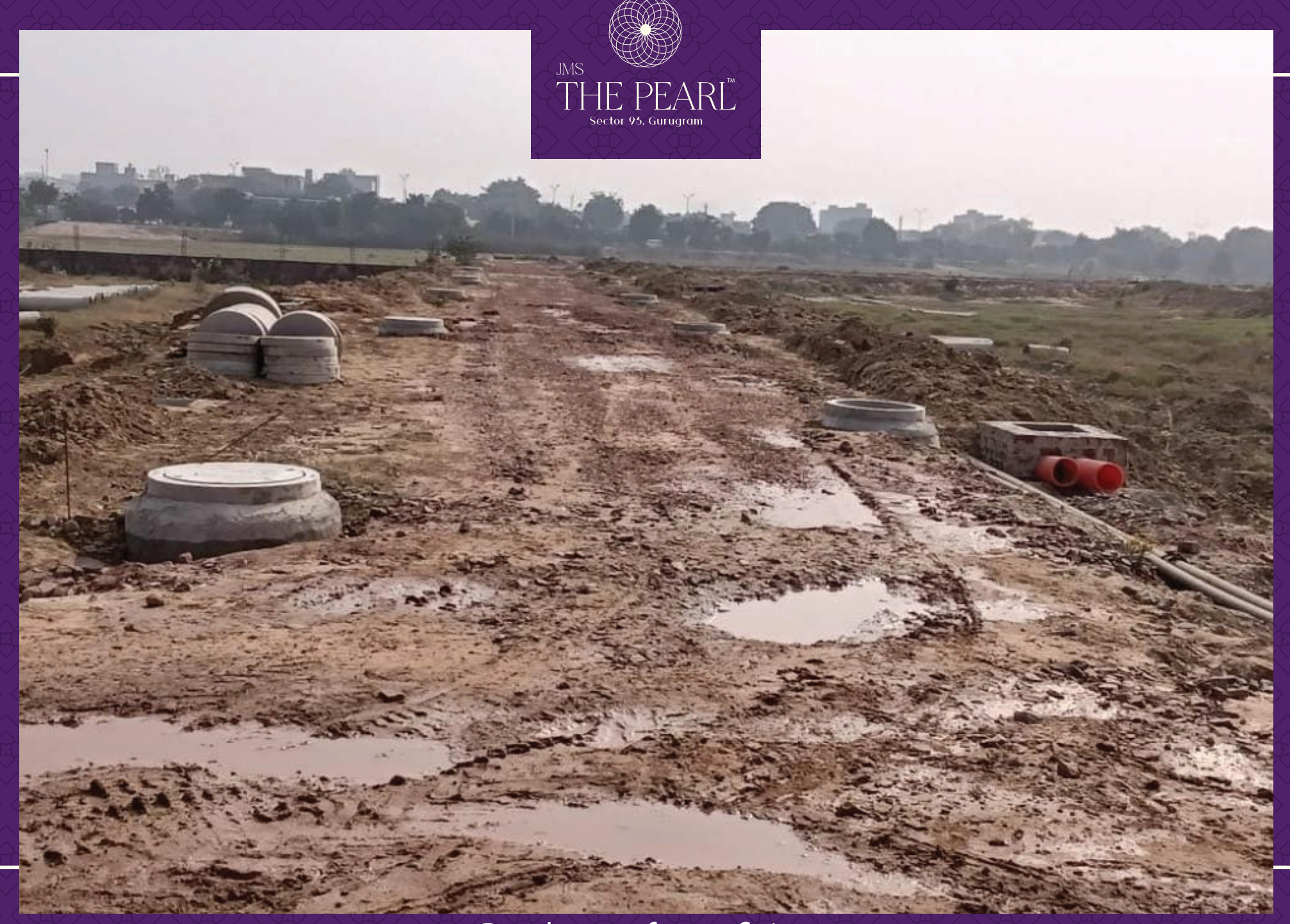
Road cover frame fixing