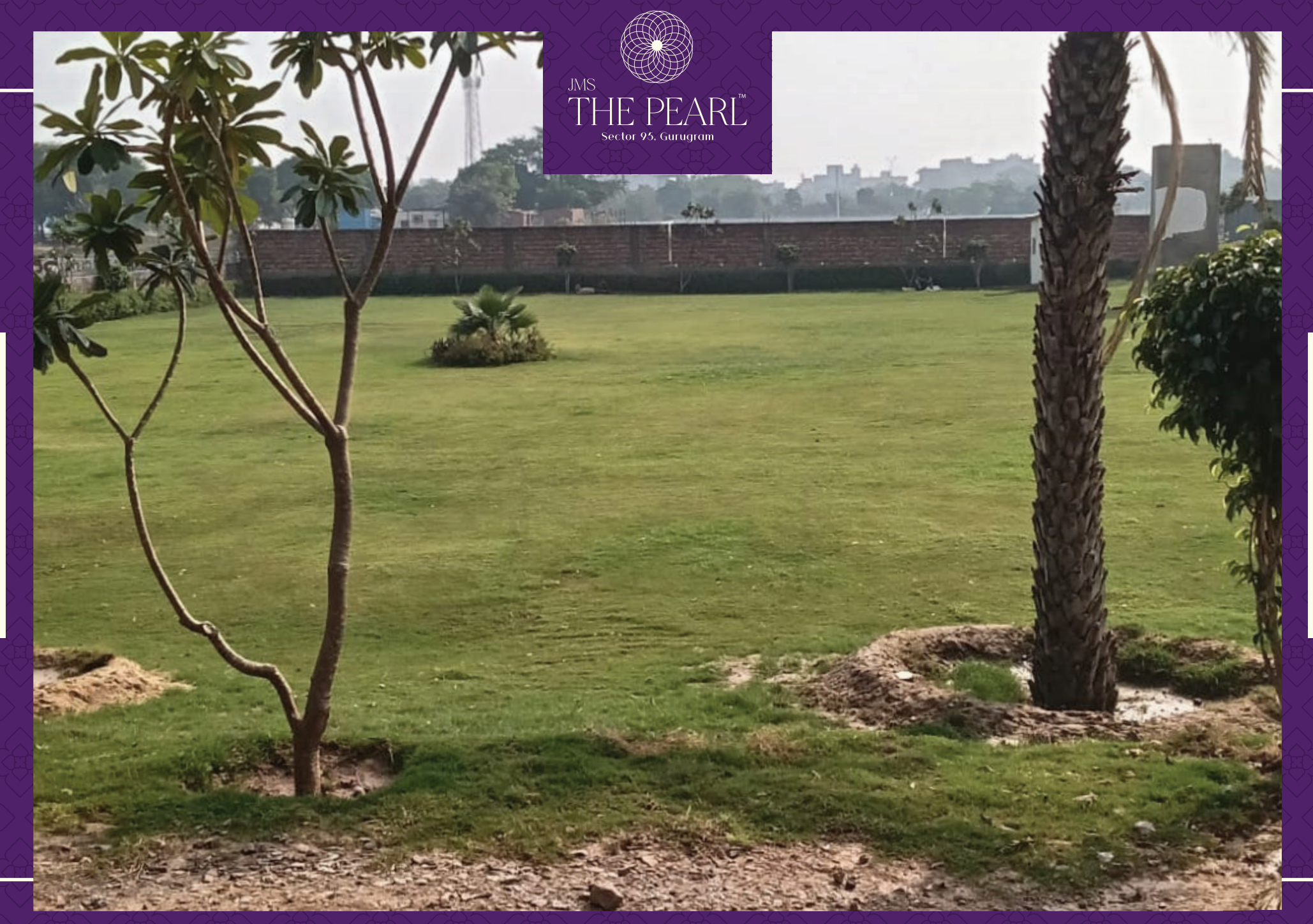
Green area development work completed