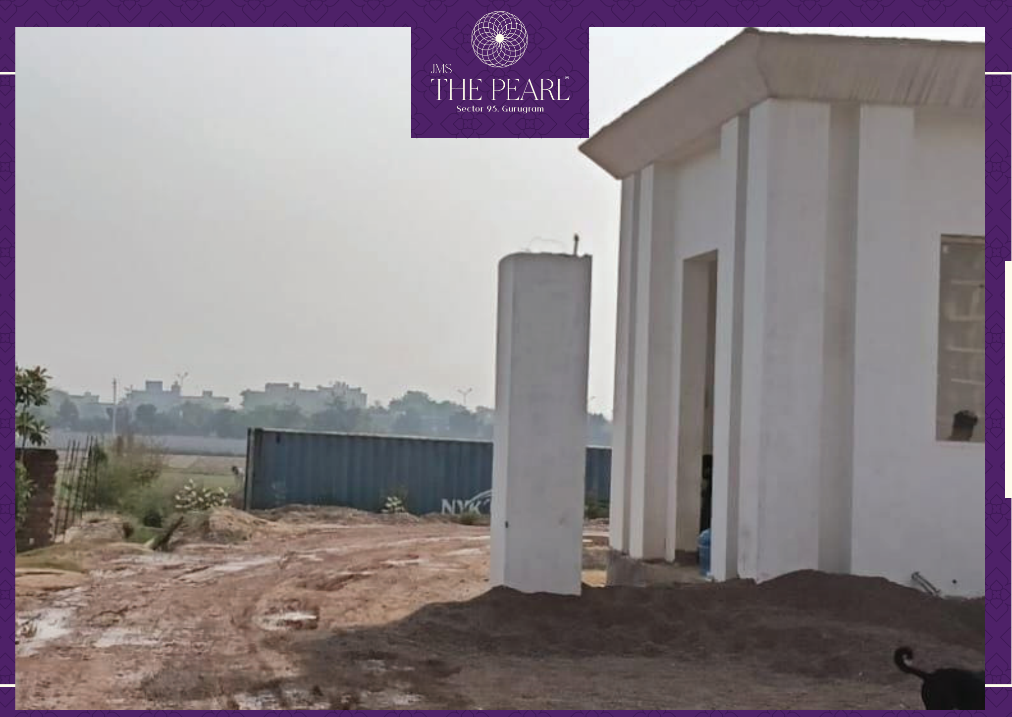
Entry gate work in progress