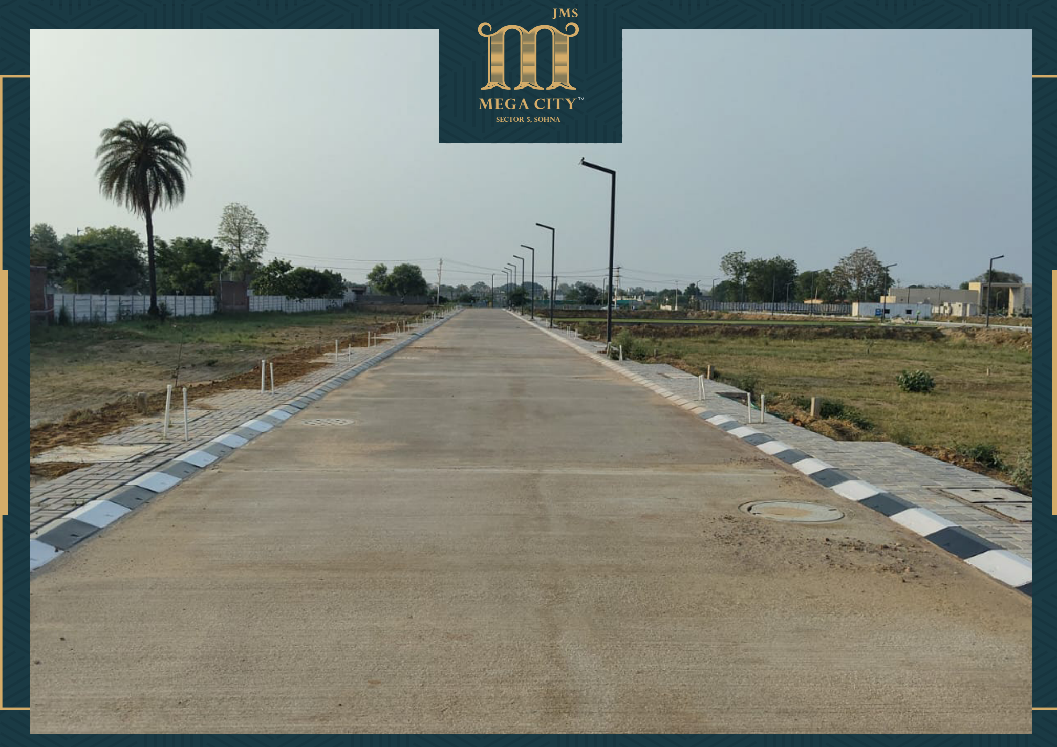
Road No. 1 Installation of electricity supply system in progress