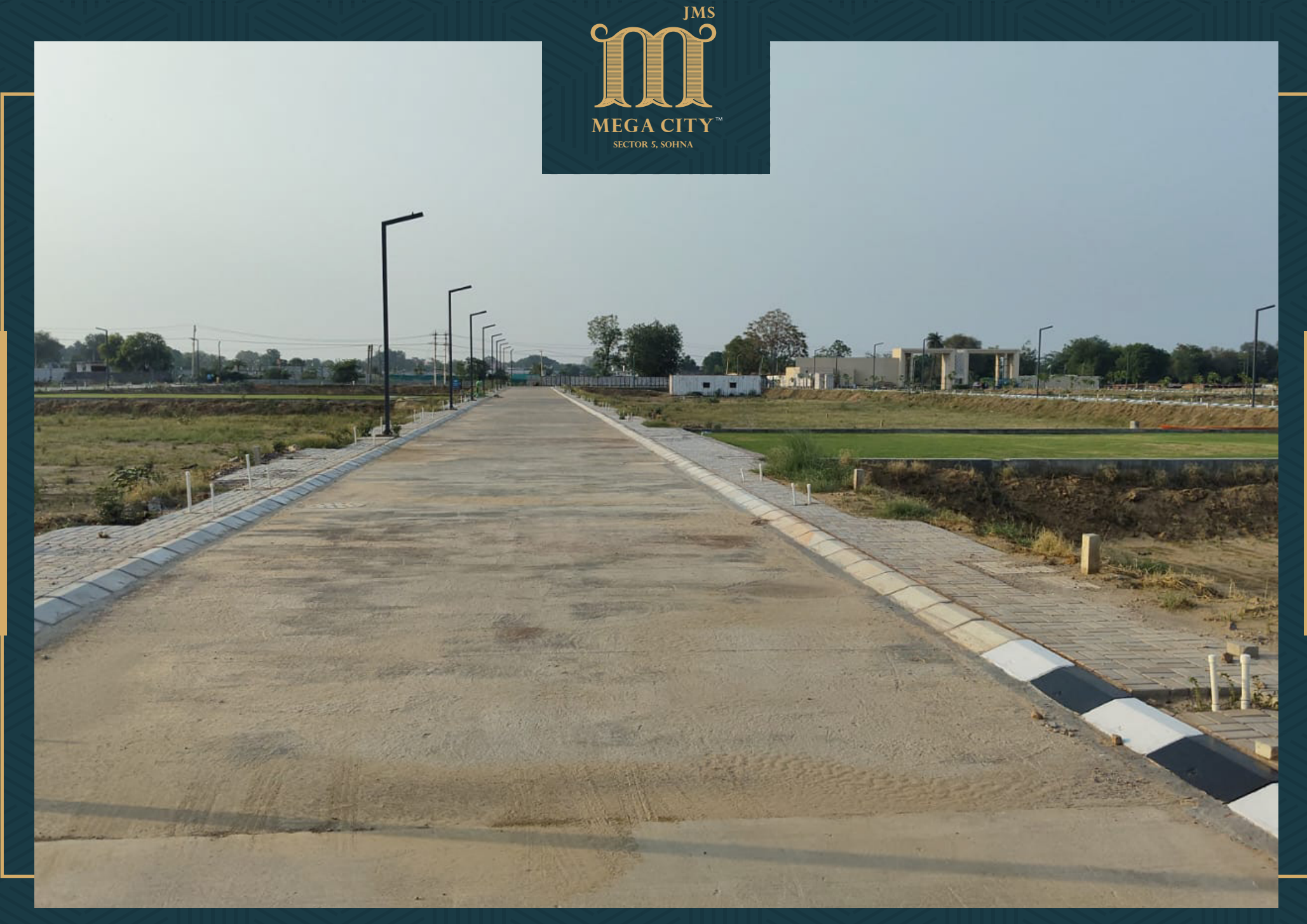
Road No. 2 Installation of electricity supply system in progress