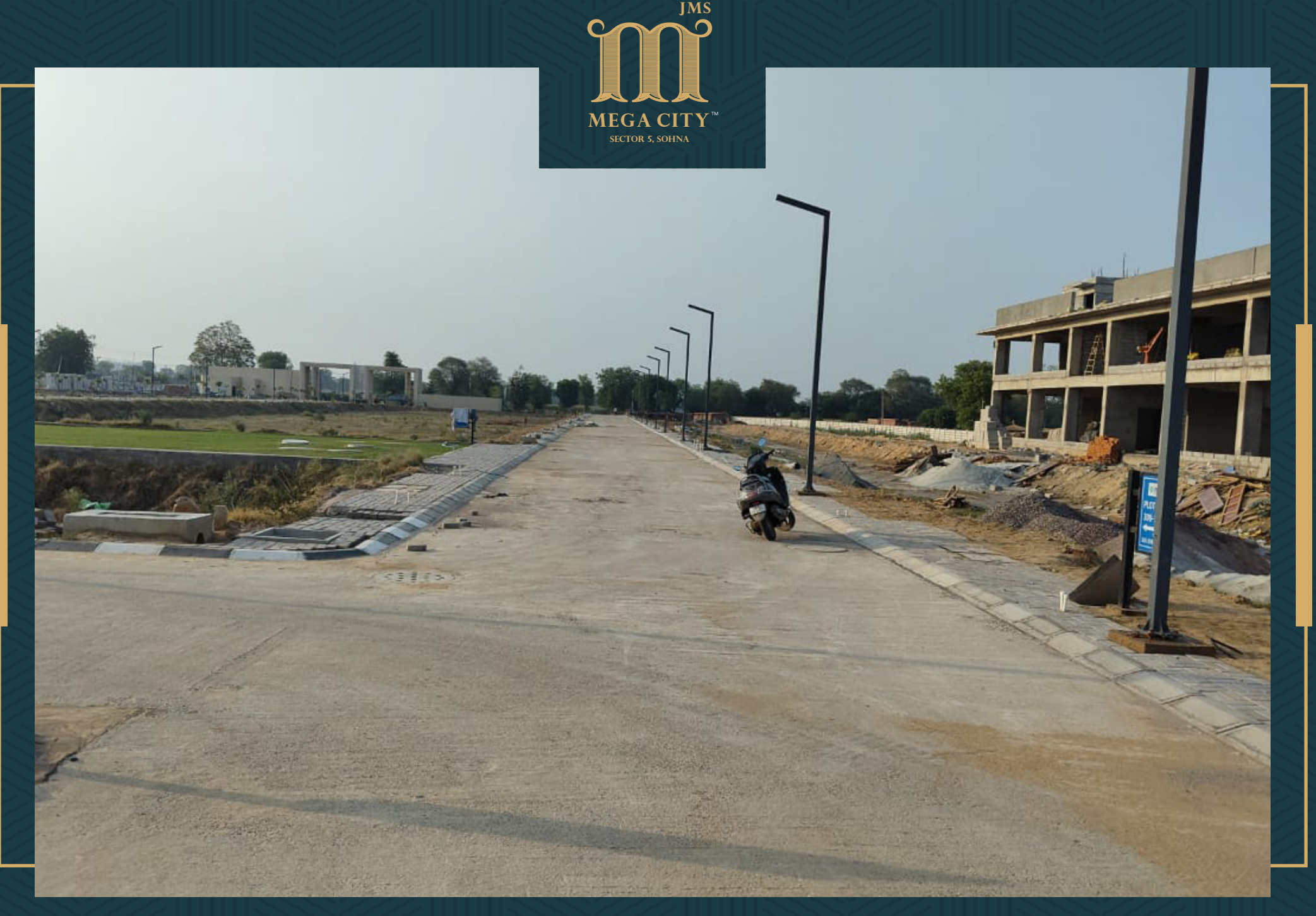
Road No. 5 Installation of electricity supply system in progress