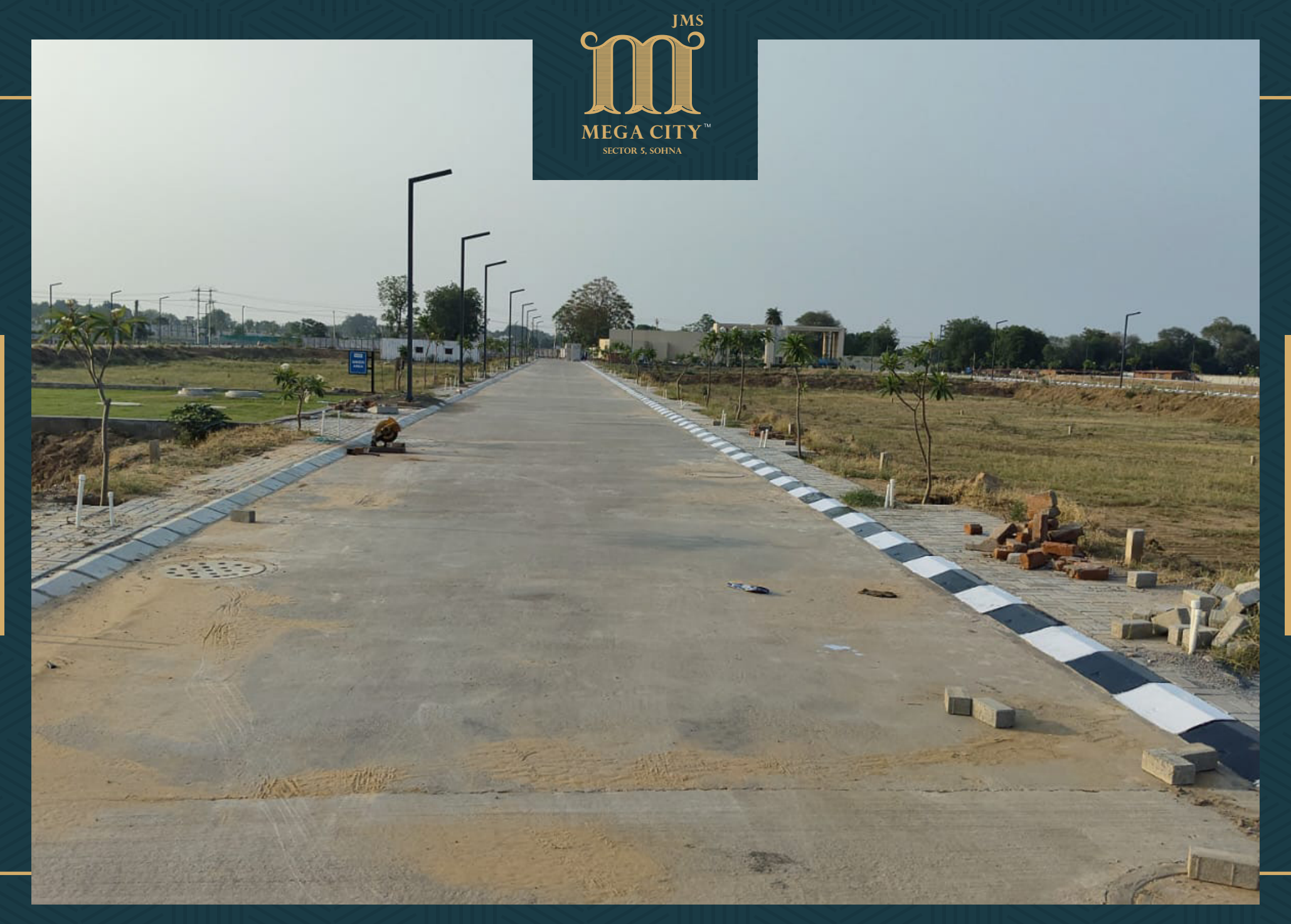
Road No. 3 Installation of electricity supply system in progress