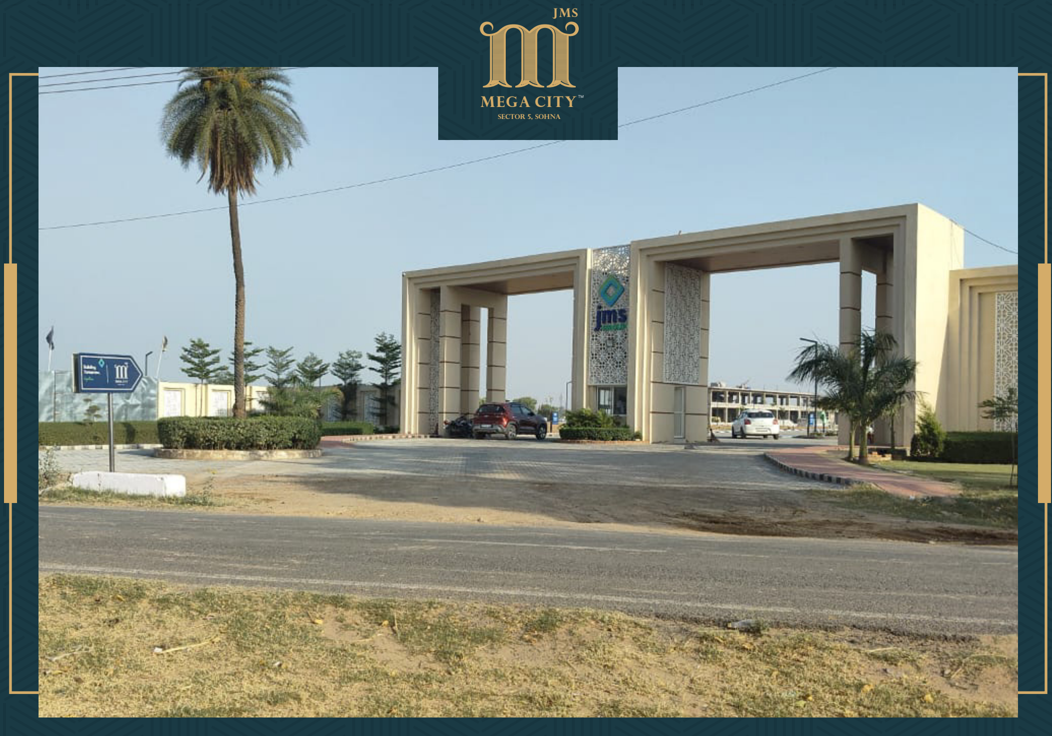
Entry Gate work completed