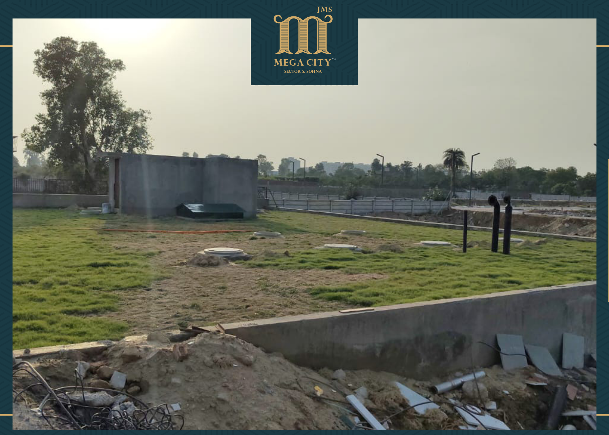
STP and UGT work completed, painting work in progress