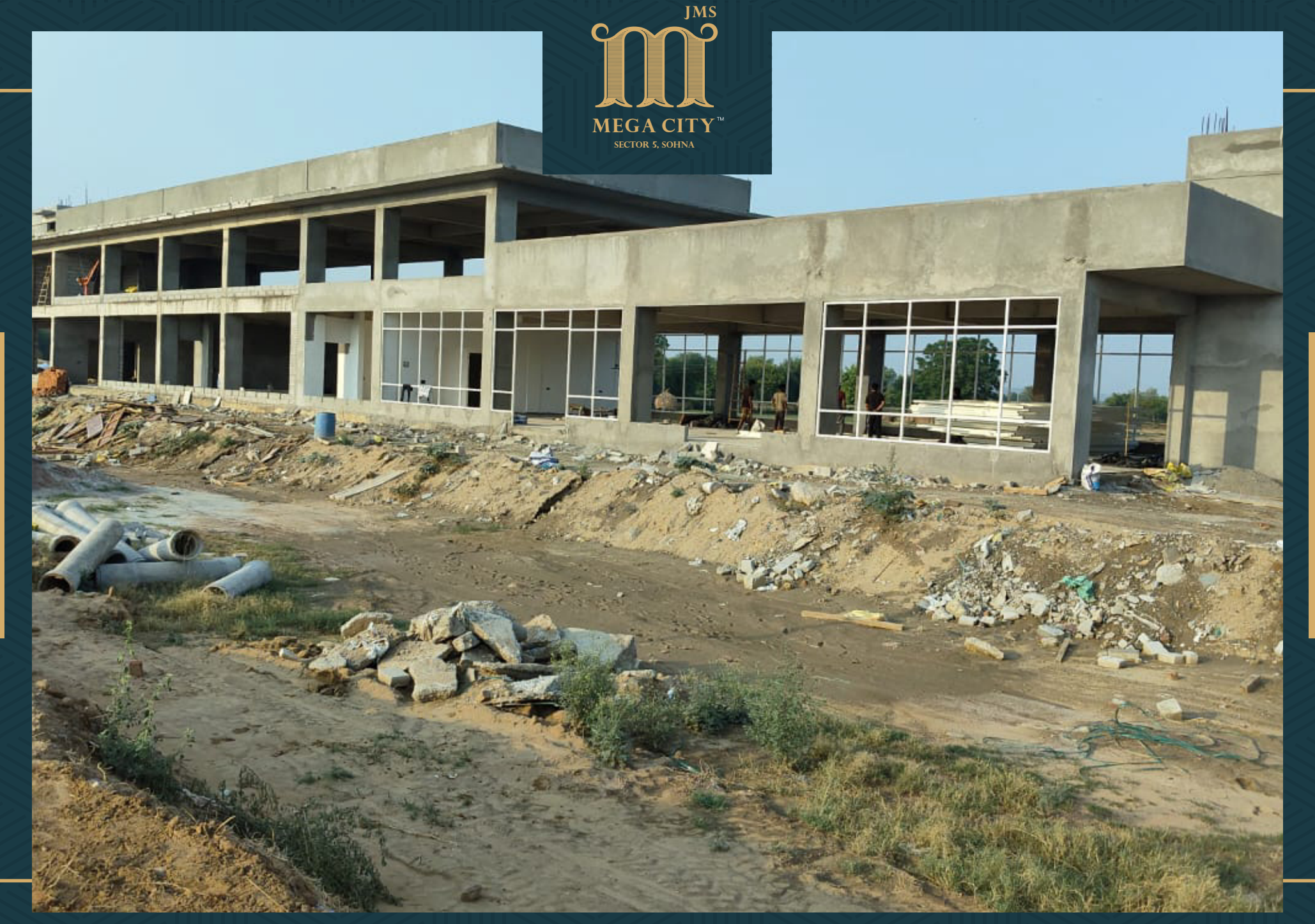
Clubhouse structure completed, finishing work in progress