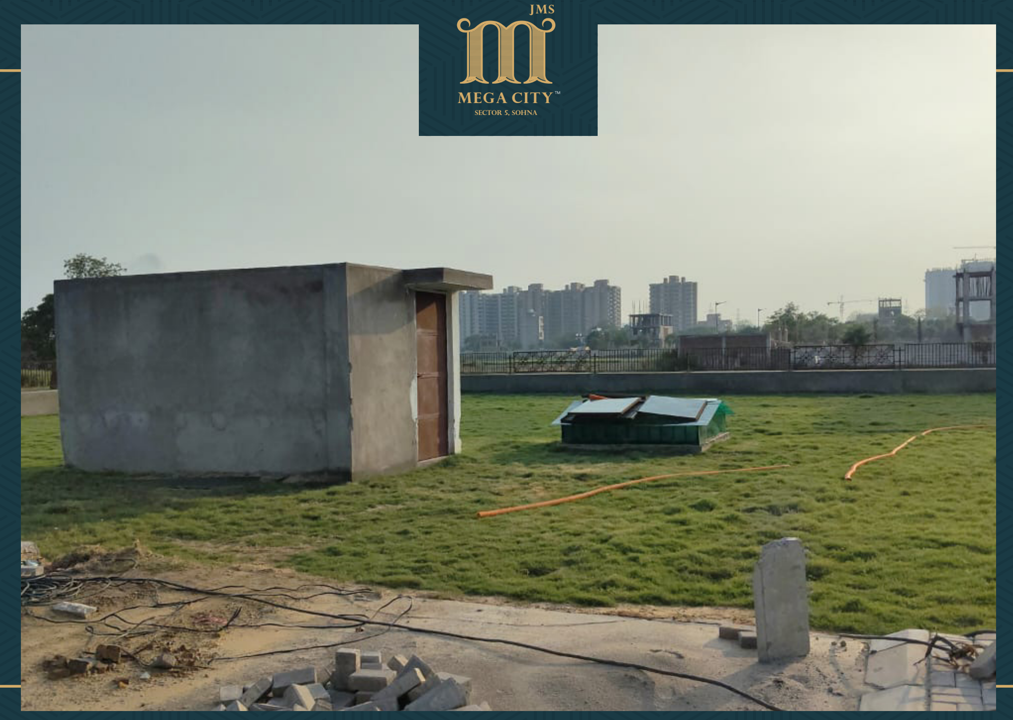
STP and UGT work completed, painting work in progress