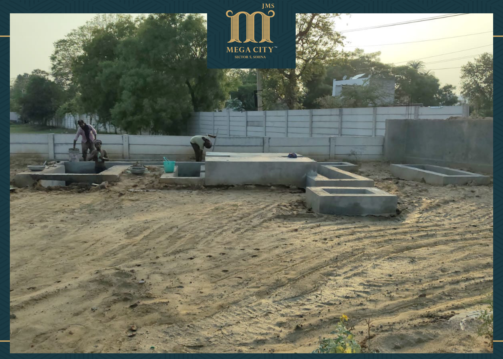
Electric system foundation completed