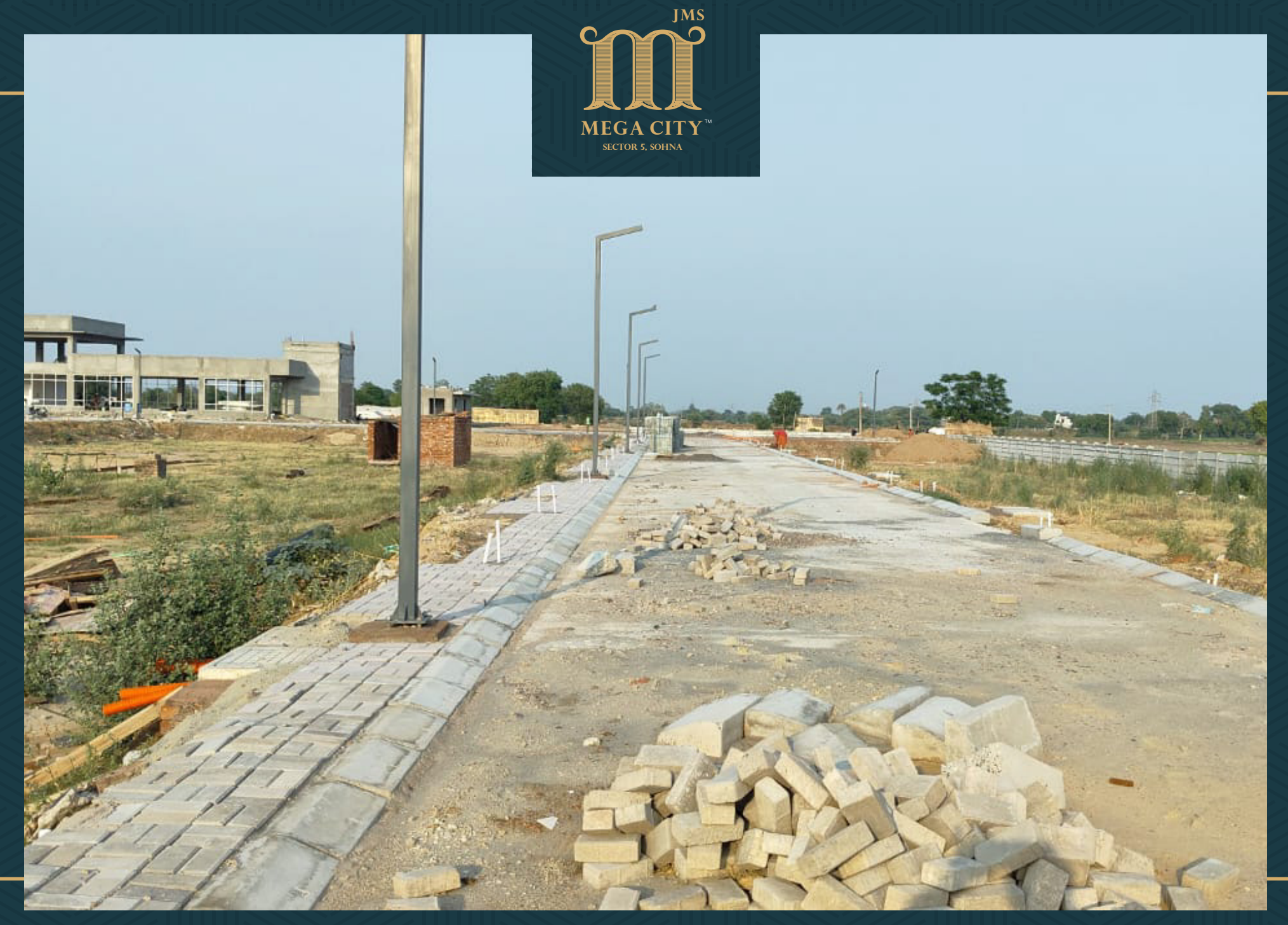
Pathway pavers work in progress