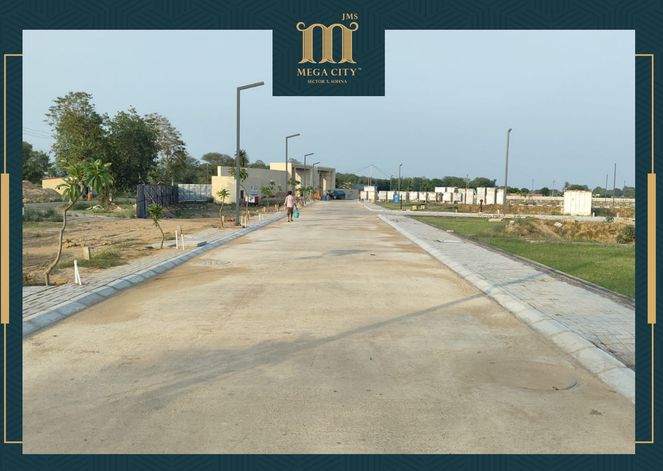
Road No. 6 Installation of electricity supply system in progress