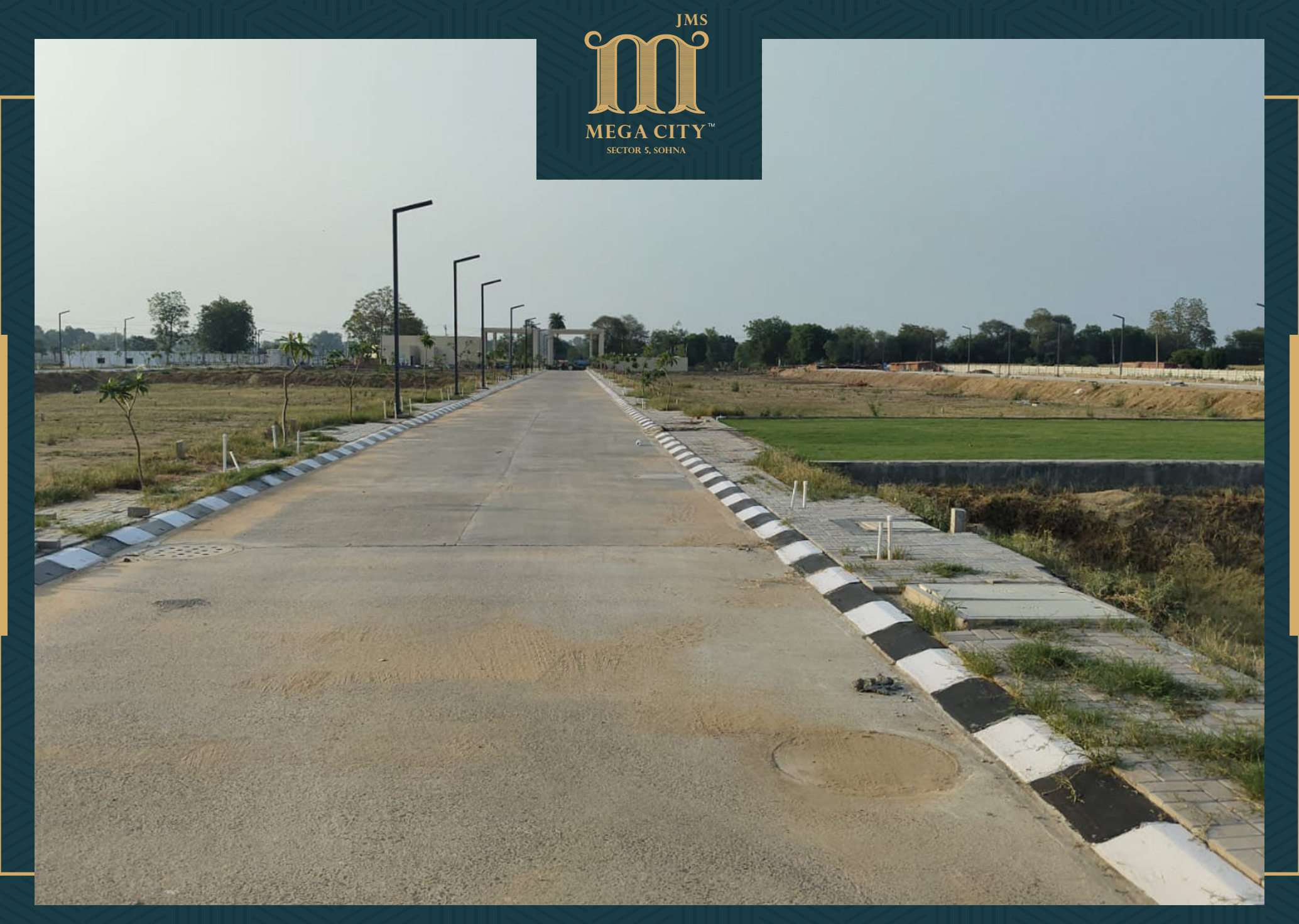
Road No. 4 Installation of electricity supply system in progress