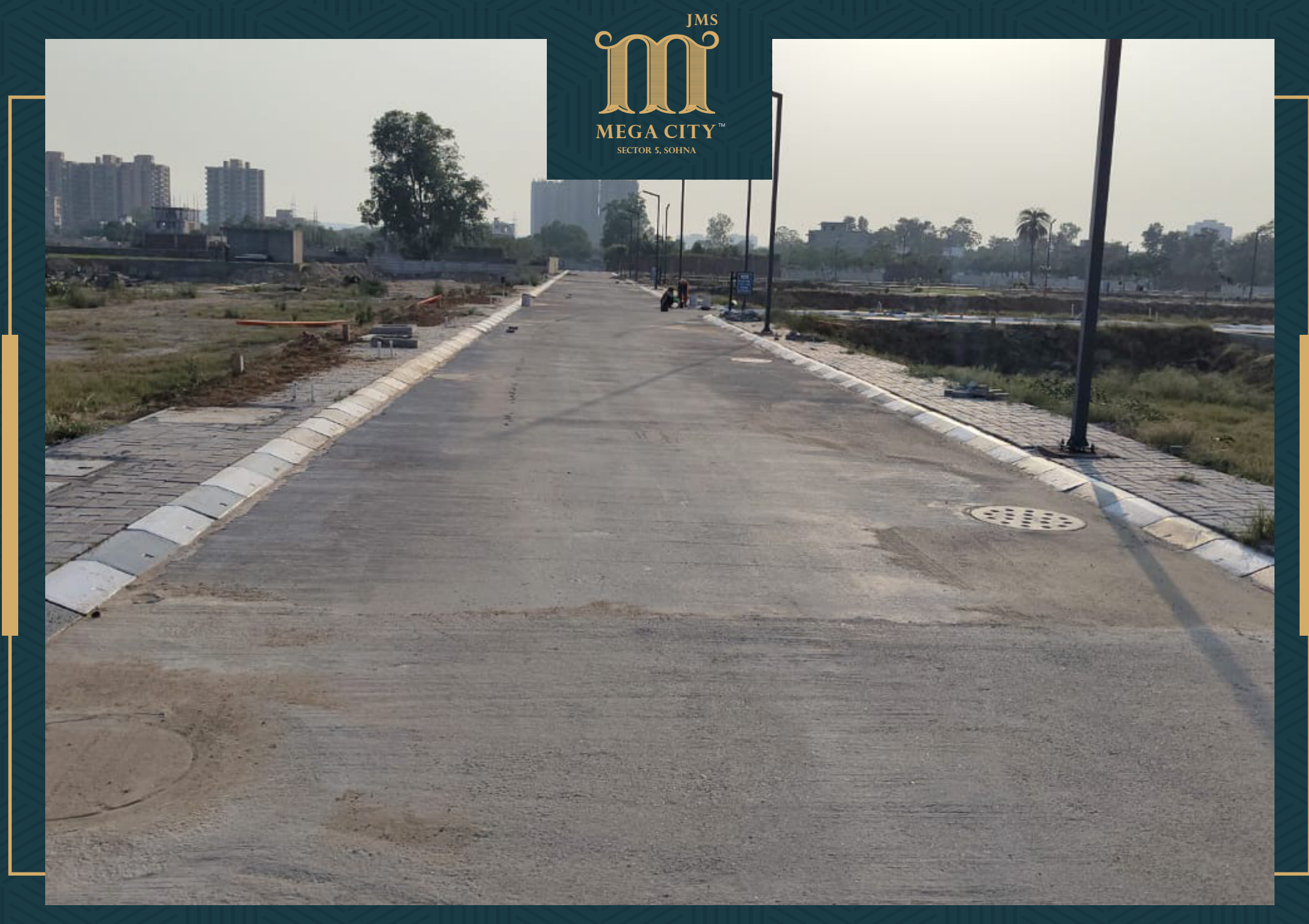
Road No. 7 Installation of electricity supply system in progress