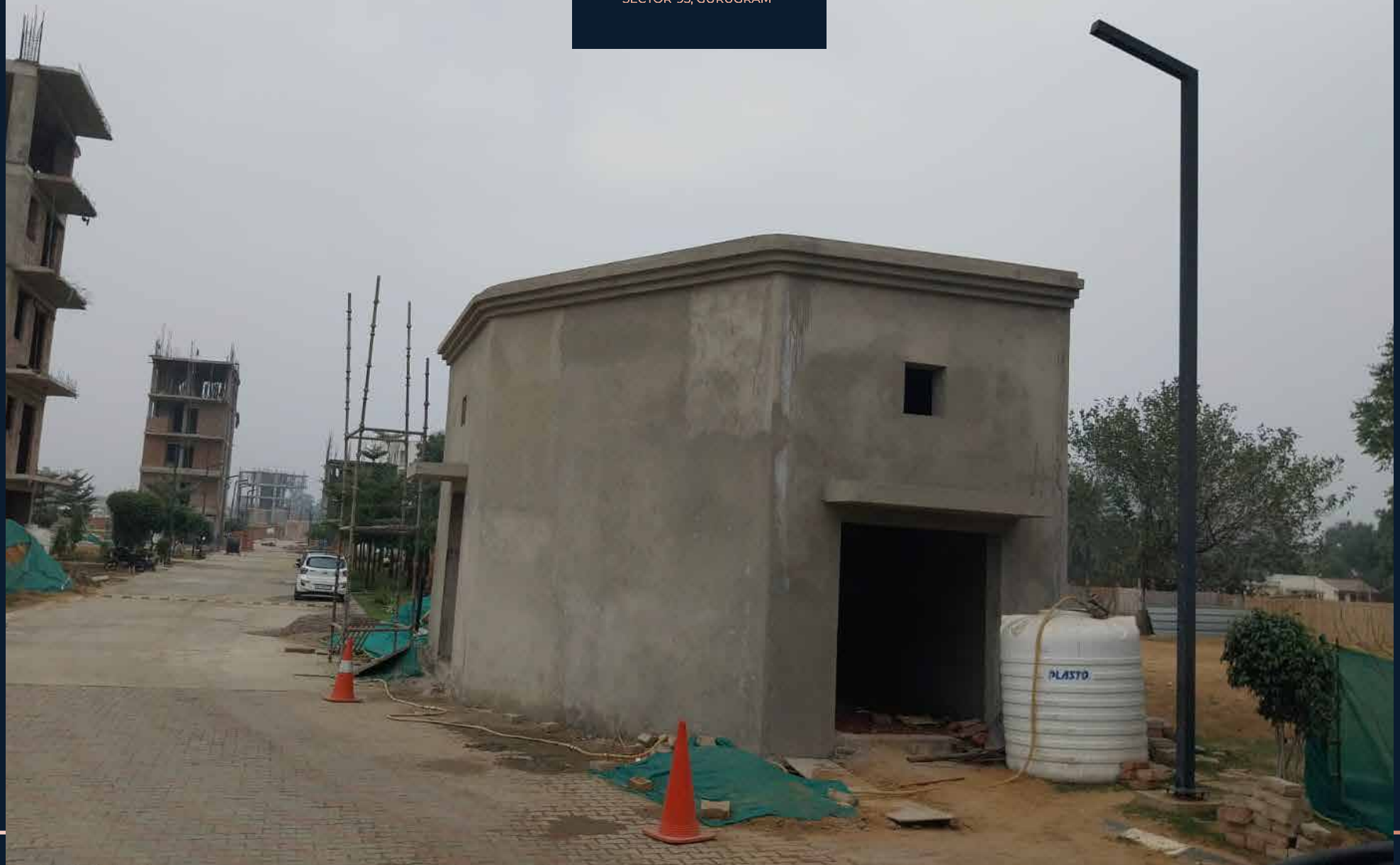
Electrical room development in progress