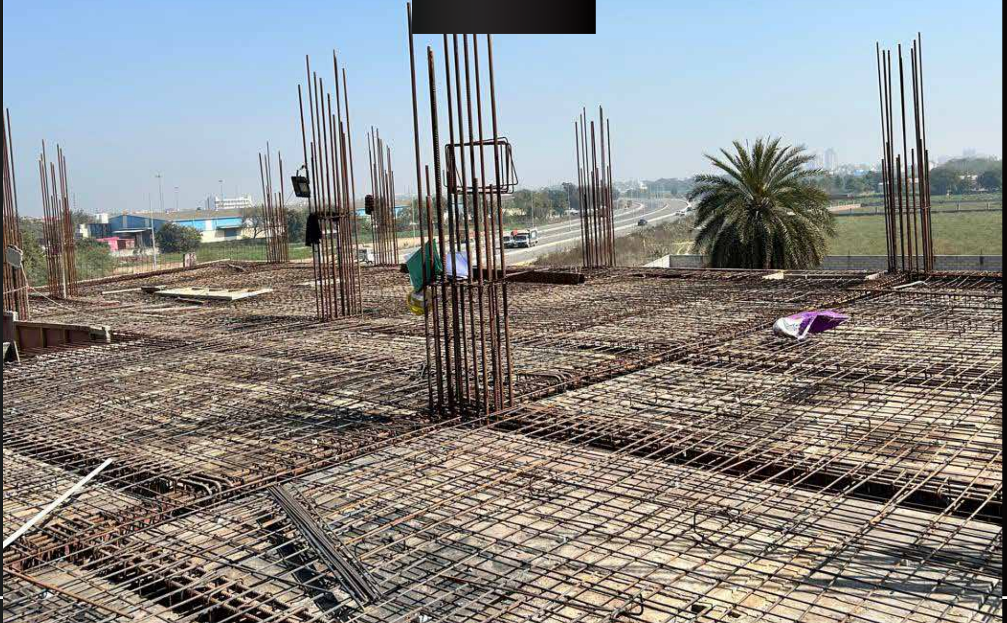
2nd floor slab reinforcement work in progress

JMS GROUP PRIDE AVENUE SECTOR 95A, GURUGRAM