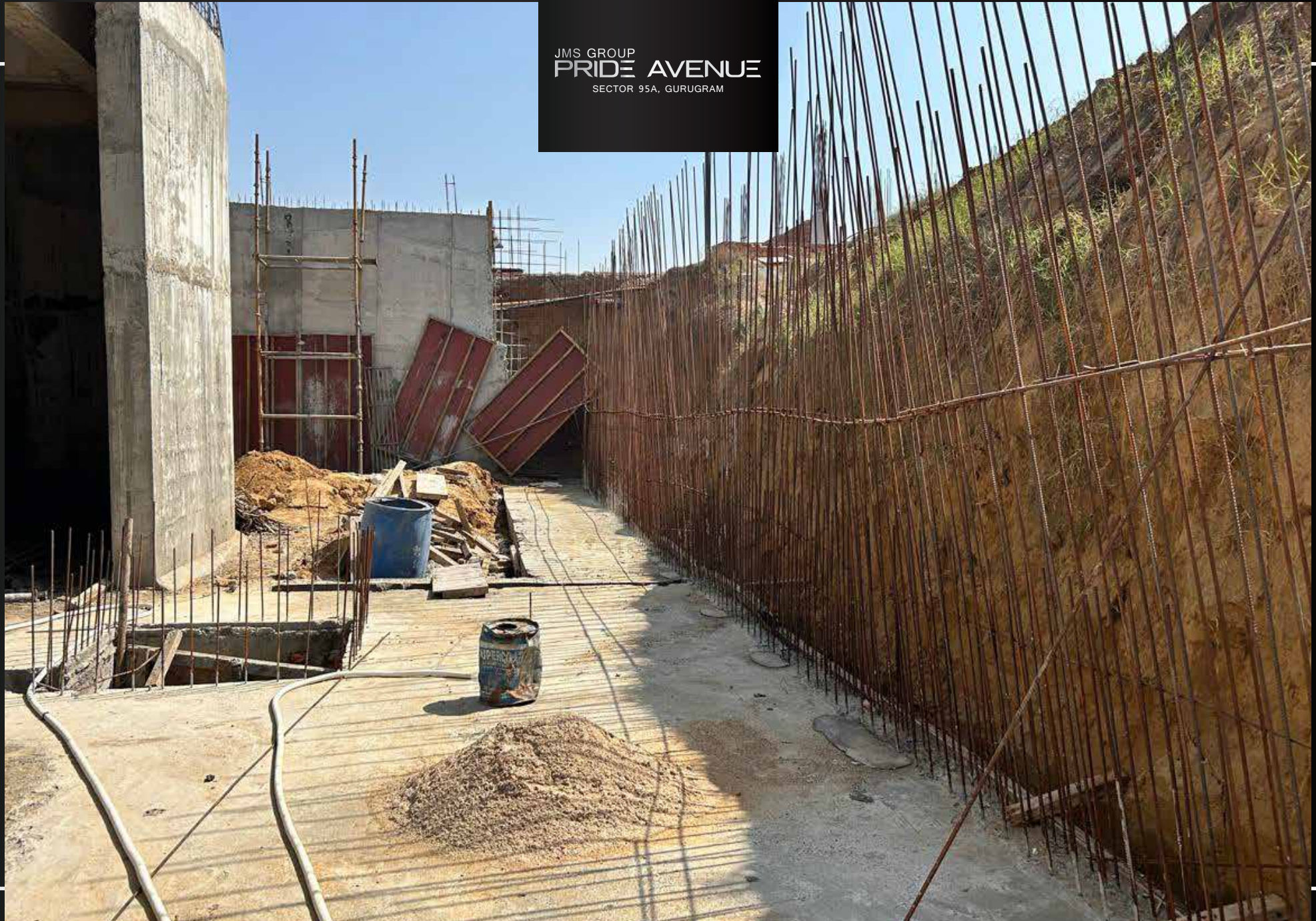
Outer retaining wall work in progress

JMS GROUP PRIDE AVENUE SECTOR 95A, GURUGRAM