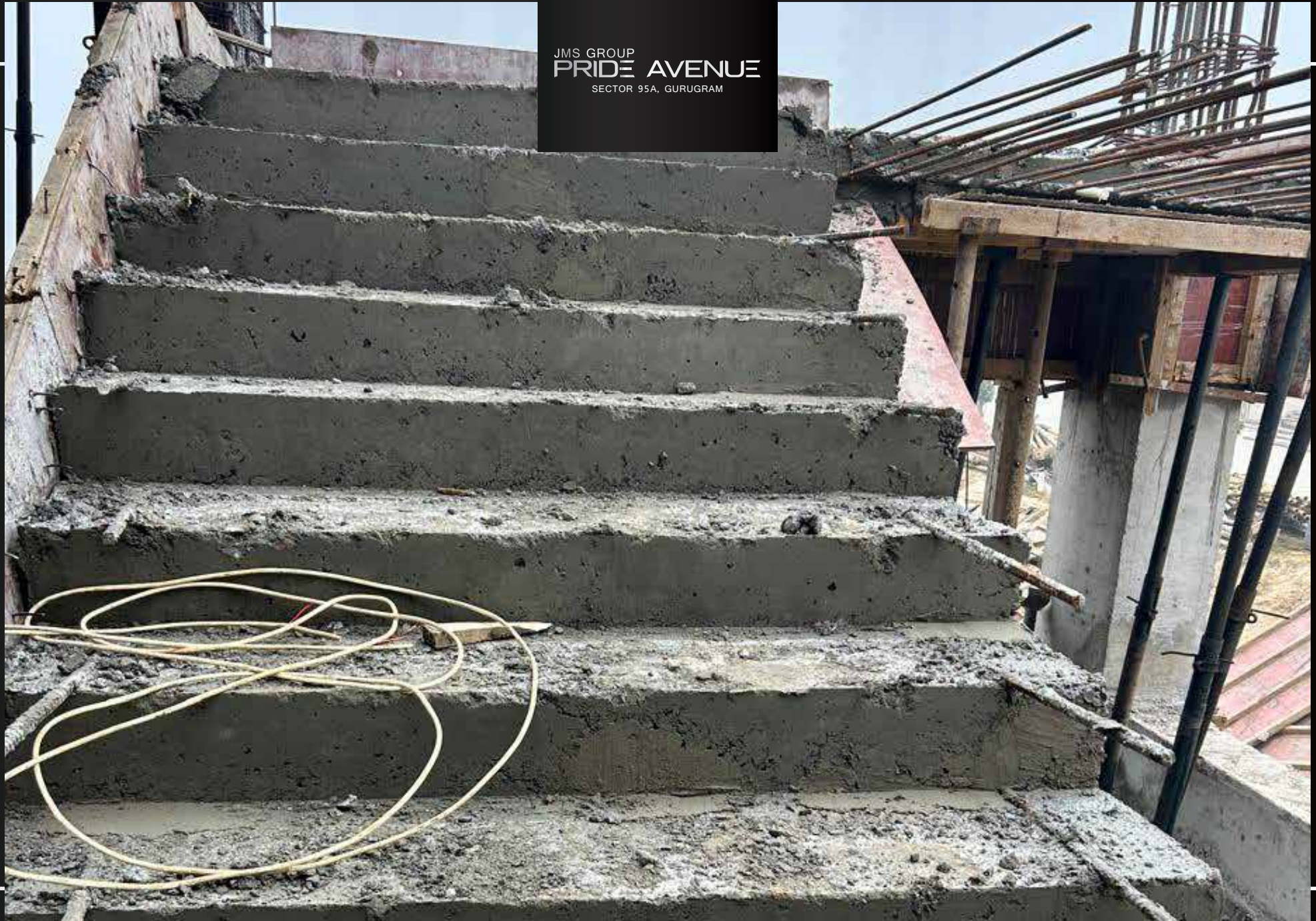
Staircase casting work completed

JMS GROUP PRIDE AVENUE SECTOR 95A, GURUGRAM