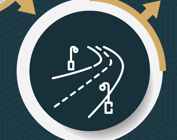
Proximity to Delhi - Mumbai Expressway (DMIC)

Educational Hub & School like (GD Goenka World School, KR Mangalam, Ryan International School, SCG Academy) in the vicinity